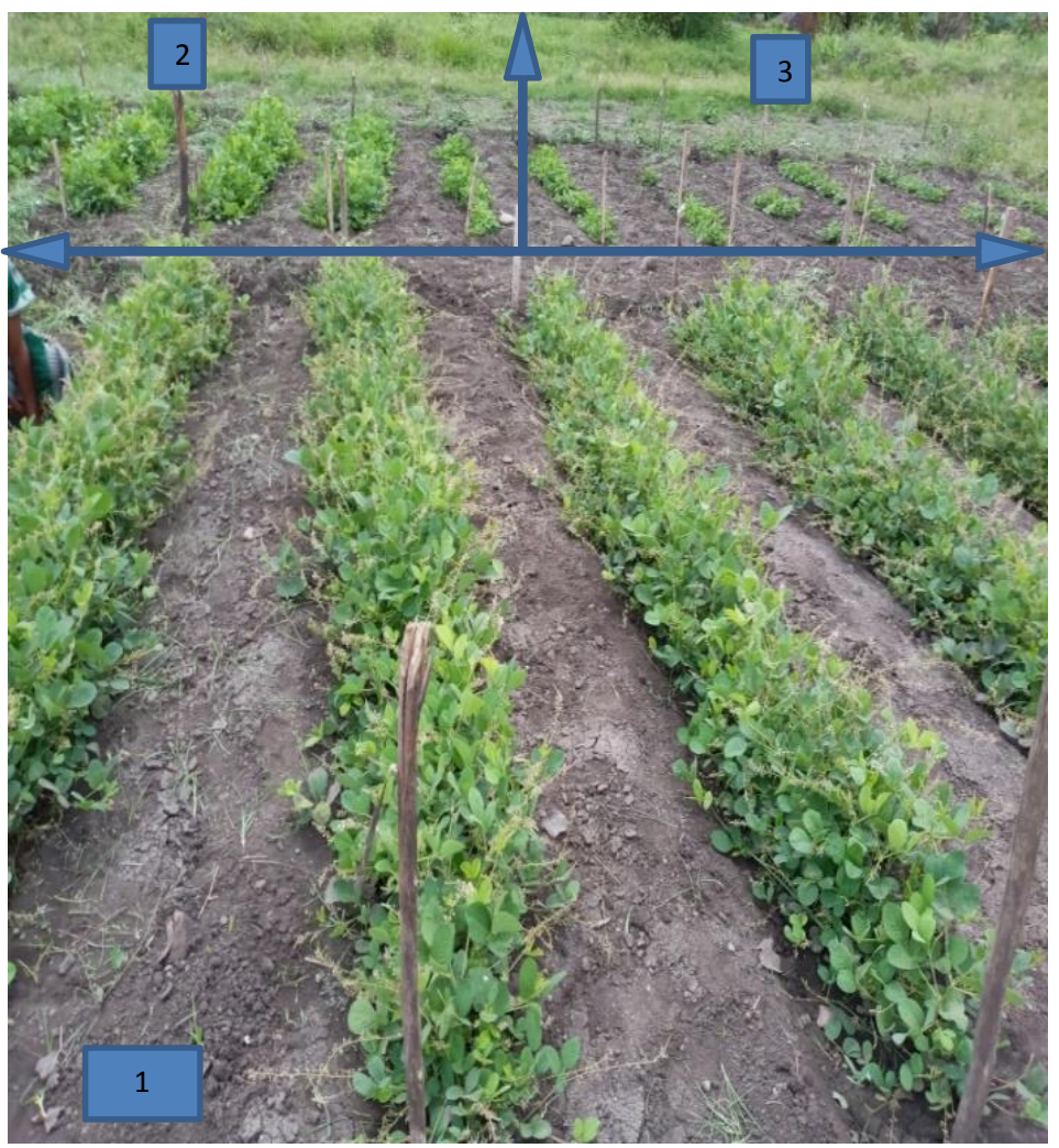
Fig. 1. Variation in emergence, establishment, vigor, flowering and maturity