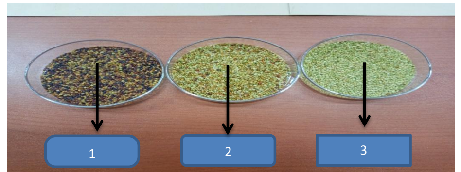
Fig. 4. Variation in seed coat color (1 - Dark brown; 2 - Brown; 3 - Yellow)