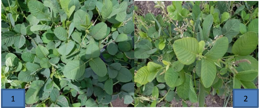
Fig. 2. Variation in leaf color (1 - Green; 2 - Light green)