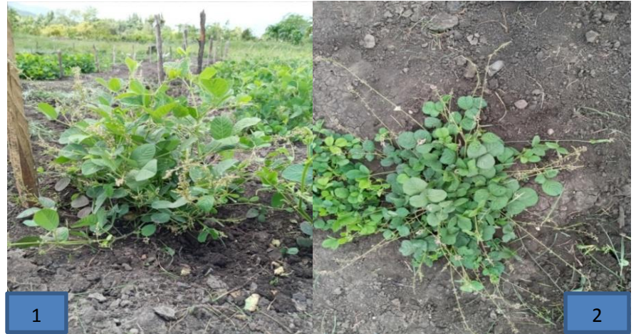
Fig. 3. Variation in growth habit (1 - Semi-erect growth habit; 2 - Trailing growth habit)