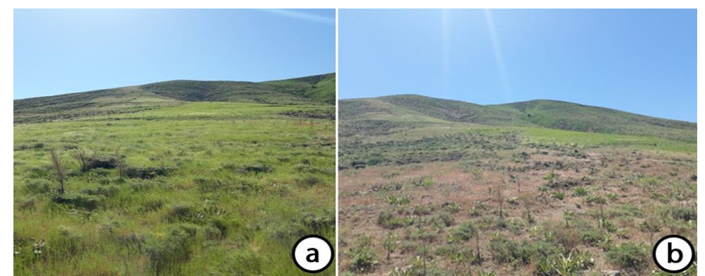
Fig. 7. a) Long-lasting green rangelands under fire compare to b) non fire control

Threats : Some locals also stated that prickly species such as Astragalus on days when snow and rain occur during the cold season of the year are the only fodder available to animals, these plants soften when it rains and on the other hand, they are always present in the area than others. Plants are only present in the rangelands during the warm seasons of the year, so the species should not be burned. On the other hand, it is believed that thorny species are grazed by livestock such as goats.