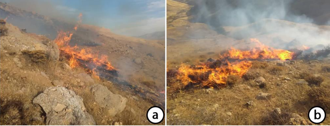
Fig 5. a and b the fire ascending to the peak of the mountains by the wind in khalkhal

Lightning: According to indigenous observations, range plants will not be fired by the heat of the sun or by the impact of lightning. In response to the question of how likely plants would fire from the heat of the sun and lightning. They said they have never seen such a thing before.