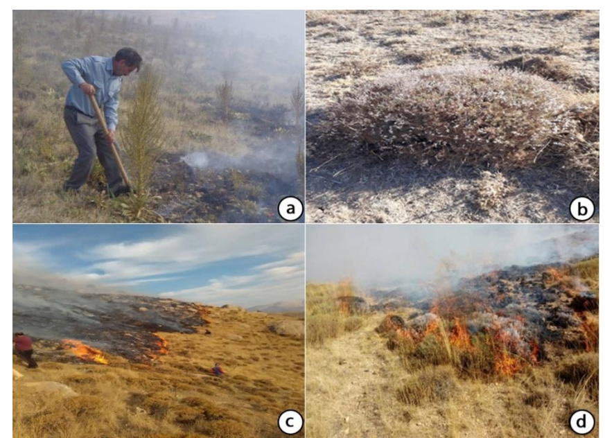
Fig. 2. Plant differences in terms of their role in fire a and b; Fire retardant c; Incendiary and carrier of fire d; Fuels in the fire