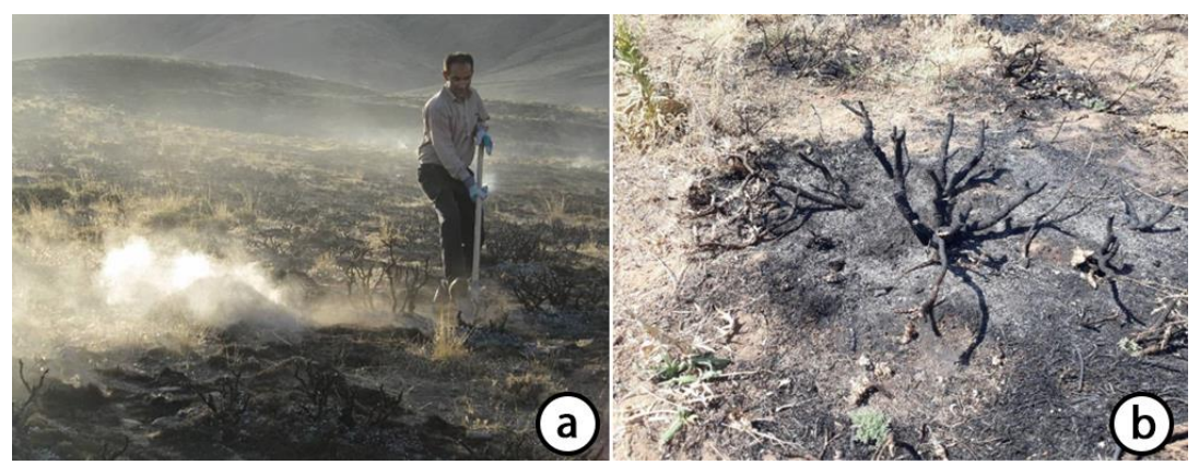
Fig. 3. Stems of Astragalus microcephalus left after the fire

form of bushes are considered. "Because Black Astragalus (Astragalus microcephalus) is spiny, it burns longer. In the past when there was no oil, this plant was used to make the fire". The fire initiates from plant thorns and spiny parts of the plant, "the thorns of the plant burns first and then, other parts of the plant start burning". Shepherds were showing the burned plants where the stems were left and the branches and leaves were completely altered to ashes to prove their point (Fig. 3).