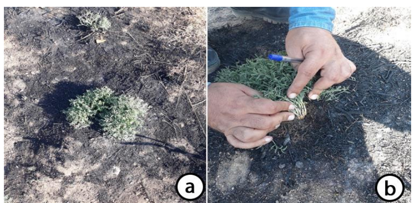
Fig. 6. a and b Sprouting of Onobrychis cornuta after fire

The time required for reconstruction: According to the results of interviews with pastoral shepherds who suffer from fire, after 6 to 7 years, it will be the same as before the fire. Native regeneration refers to the presence of pre-fire species in the plant composition. Based on their observations, the local plant communities started after 3 to 4 years. They stated that distinguishing between burnt places from non-burned places after another 7 years is not possible.