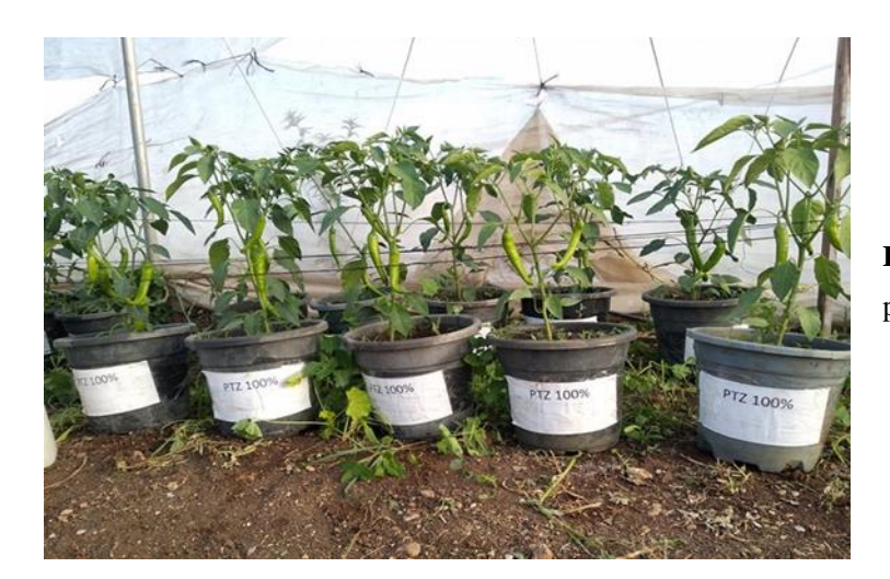
Fig. 3 Pepper seedling cultivated in pots during the field experiment

two weeks of the growing period, and increased gradually to reach 3 L per plant at the end of the experiment. Compound liquid fertilizer (6:6:6) was applied to the control plants based on the nutrients requirement of pepper plants during the first growth stage for a period of one month, after which compound liquid fertilizer (5:3:8) was added during the rest growing periods (Table 1). Two types of treated OMW were used in the experiment; OMW treated by the solar reactor and OMW treated by sedimentation bond. The treated OMW was applied to the plant as a liquid fertilizer either at 100 or 50% dilutions (Table 2).