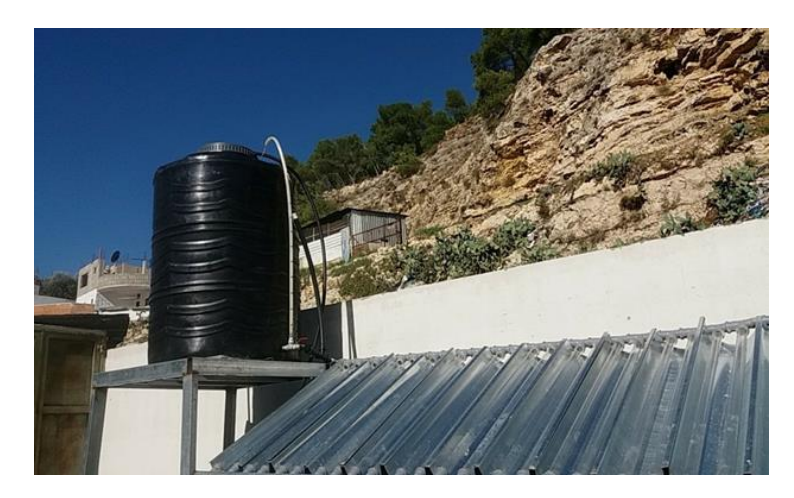
Fig. 2 The solar reactor which used in the treatment of OMW

Olive mill wastewater was collected from a threephase olive press. The sample was placed in a 1000 L plastic container (Fig. 2). The OMW was supplemented with 2000 gr FeSO<sub>4.7</sub>H<sub>2</sub>O to make a concentration of 0.1 M that allows iron to dissolve. The pH of OMW was adjusted by application of 1 M HCl to facilitate the solubility of iron. After that, 150 ml of H<sub>2</sub>O<sub>2</sub> was added to the tank to start the Fenton's reaction. During the reaction, the OMW was allowed to flow to the reactor over a period of 8 hours, and the treated OMW was collected in another container. The pH of the treated OMW was adjusted to 7 by application of 1 M NaOH.