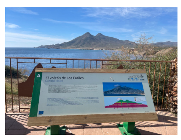
Figure 5. New geological information panoramic pannels (EN/SP).

- House of the Volcanoes content update and renovation carried out during 2022–2023 (Fig. 4). Being one of the two visitor centers inside the Geopark, it is the only one dedicated exclusively to the geological and mining heritage of the territory.