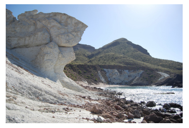
Figure 2. Pyroclastic deposits in Cala Raja.

Geochronological data show that the main volcanic activity in Cabo de Gata developed for just over 7.5 million years (Ma). The oldest and most active episode took place during the Serravallian division of the Miocene (13.82–11.63 Ma) with the development of explosive volcanism, of a rhyolitic nature, which produced a significant volume of ignimbrites at Cala Rajá, Vela Blanca and Cala Higuera (Fig. 2), and effusive volcanism, with