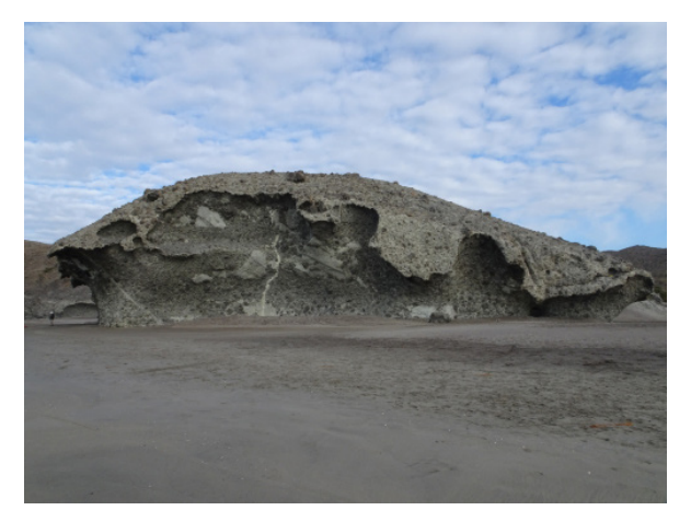
Figure 3. Hyaloclastites in Mónsul.

domes and submarine flows of an andesitic to dacitic nature at El Bujo, Mónsul, El Barronal, Lo Genoveses and La Isleta del Moro (Fig. 3).