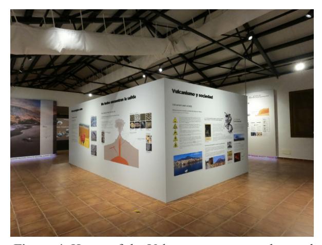
Figure 4. House of the Volcanoes content update and renovation.

- Establishment of a network of public-use trails to make geosites of interest accessible to visitors.