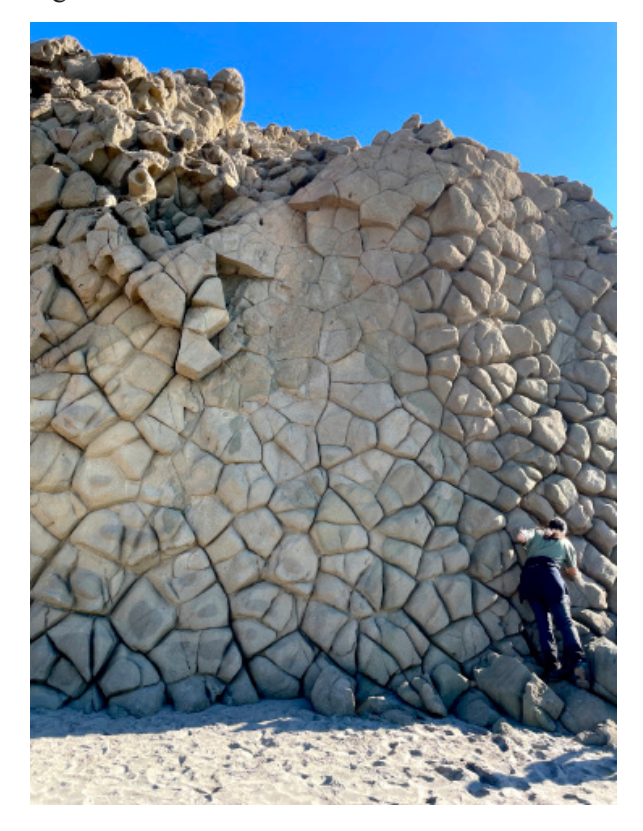
Figure 7. Columnar joint outcrop at Mónsul Coast Geosite during a scientific group visit.

- Workshops on the geology of the Geopark, and conservation of the geological heritage. Among these, it is worth noting the European Geoparks Week and the Geopark in winter programme. Established in 2018, it includes guided geological routes during the low season to boost dissemination in the Geopark. Collaboration with the University of Almería in the organization of the Geolodía (a national even celebrated jointly across Spain) when it is held in the Geopark, as well as with the Geological Society of Spain in the celebration of its Scientific Sessions, the Geopark being the venue for the last one held in December