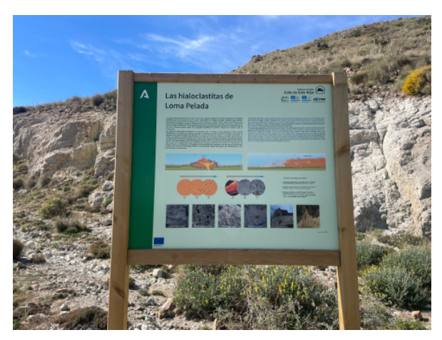
Figure 6. New complementary geological pannels (EN/SP).

- Signposting with interpretive panels (Figs. 5 and 6).