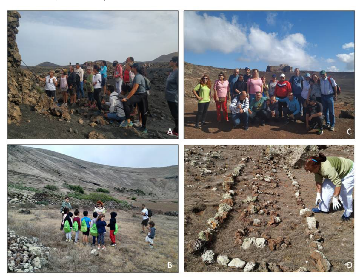
Figure 3. A) Activity "How to Reduce Volcanic Risk?". B) Environmental activities for children. C) Course "Volcanoes for everyone" for Tourism Guides, D) Elimination of rock buildup of anthropic origin

with educational centers of the municipalities who value both the Geopark in general and the Geological Places of Interest that are located near the center, since each center is committed to monitoring a geosite. For this purpose, there is a group of monitors hired by Geopark through a local environmental education company. With this same project, environmental education work is carried out with groups of sports schools and summer camps.