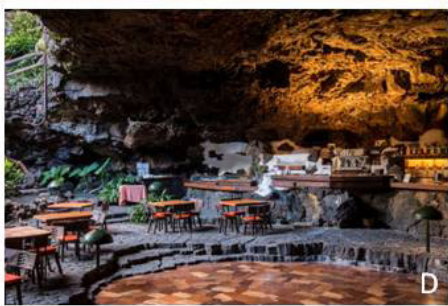
Figure 2. A) Monumento al Campesino over volcanic materials B) Concer inside Cueva de los Verdes. C) Tourist visit in Montañas del Fuego. D) Jameos del Agua.

the Moon on Earth. They originated after the volcanic eruptions in the south of Lanzarote between 1730 and 1736 resulting in the Timanfaya National Park. Montañas del Fuego has a desert-like beauty and a range of other shades that leave visitors in awe. From the depths of the earth, Islote de Hilario stands out, surrounded by a 200 km2 sea of lava where 25 inactive craters lie. The furnace at El Diablo restaurant uses the natural heat of the earth to cook unique dishes under our feet, ten meters deep, at almost 300 degrees. Extreme heat rises to the surface and creates unforgettable moments for visitors. The natural and artistic landscape of Montañas del Fuego allows tourists to do the Ruta de los Volcanoes in special vehicles to live the experience and see the wonders of nature, in this