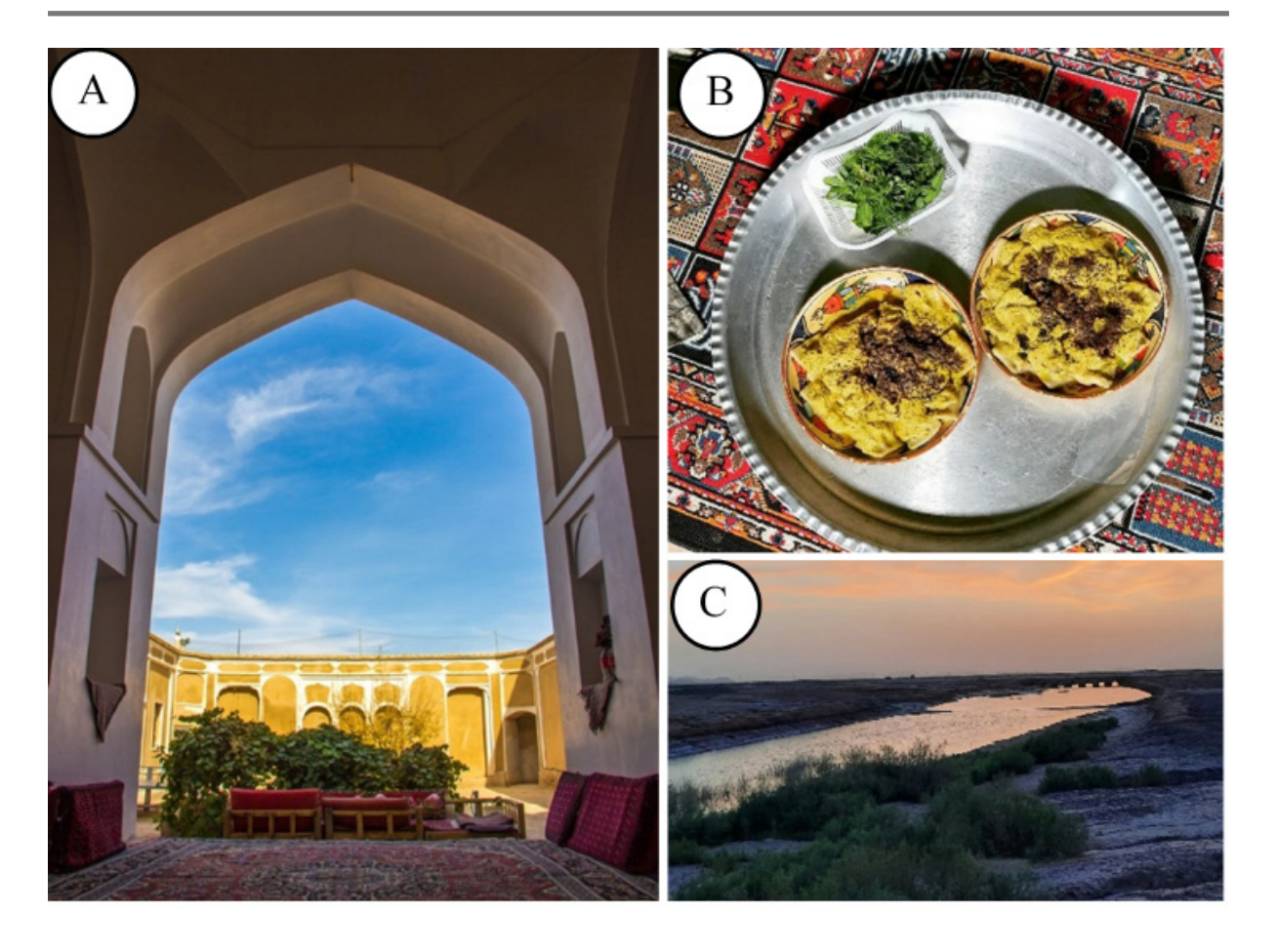
Figure 3. A) One of the native hotels near quant. B) One kind of traditional food, "Ash-e-Joshpareh." C) View of vegetation and seasonal river of Gonabad "Kal-e-Shoor."

a high or even a medium value in terms of nature and vegetation, but this ganat is a historical engineering masterpiece with a high and extraordinary value. However, according to the GAM, this is a single element, scoring 0.25. This quant is located in a flat and low area, has a very suitable asphalt road, and has many communication networks such as telecommunication and internet networks. Near this ganat, there is an appropriate two-lane asphalt road with access to big cities such as Birjand and Mashhad. Other functional values such as proximity to the city and basic facilities (number of parking spaces and gas stations) provide favorable scores. Qasabah qanat scores 5.5 out of 9 points for tourism values. It has been advertised nationally in media and newspapers, and many programs and documentaries have been broadcast on national ra-