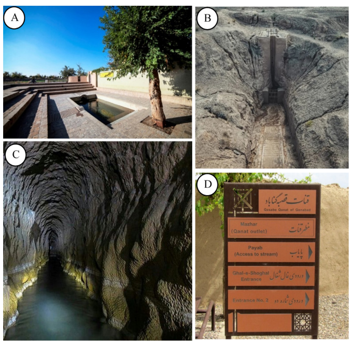
Figure 2. Some pictures from Gonabad Qasabeh qanat. A) qanat outlet B) Entrance No.1 C) A view from inside the qanat D) Qanat entrance board.

Gonabad's catchment area is 1872 km2, almost half in the highlands (mainly in the south), and the other half is in the plains. This area has 300 qanats with an annual discharge of 30 million m3 (Mirani Moghadam et al. 2020). The flow rate of Qasabeh Qanat is 162 l/sec (Hassanpour & Khozaymehnejad 2017). This qanat is a collection of eight qanats in Gonabad city. While the qanats are mostly single-stranded and, in some areas, have three strands, from this point of view, the Gonabad Qasabeh Qanat is a fantastic phenomenon (Fig. 2).