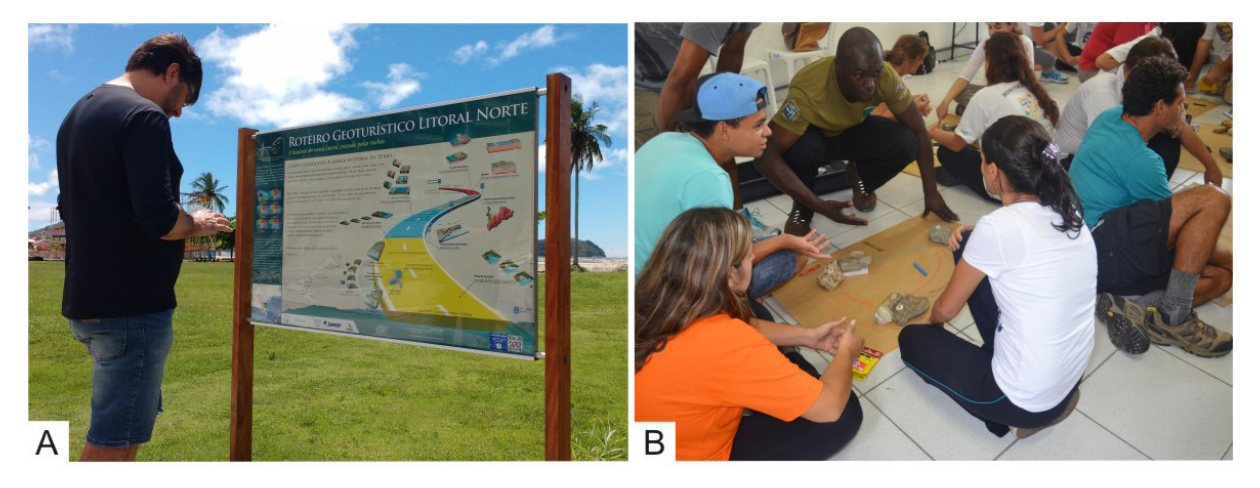
Figure 3. A) Interpretive panel located on the north coast of São Paulo, part of a set of 12 panels that, together, tell the geological history of the region; B) Training geosciences course for environmental guides at the Serra do Mar State Park. These courses comprise both conceptual and practical activities with the aim of disseminating geoscientific knowledge to be transmitted to park visitors.

According to CATI (2015), approximately 125 rural properties in Ubatuba are classed as family farming, a common scenario on the north coast of São Paulo. In this sense, SDG 2 (Zero hunger), by focusing on assessing the best places for implementing family farming, can benefit from research related to geodiversity. Identifying and evaluating geosites can contribute to the choice of the best locations for family agriculture by identifying areas with fertile soils.