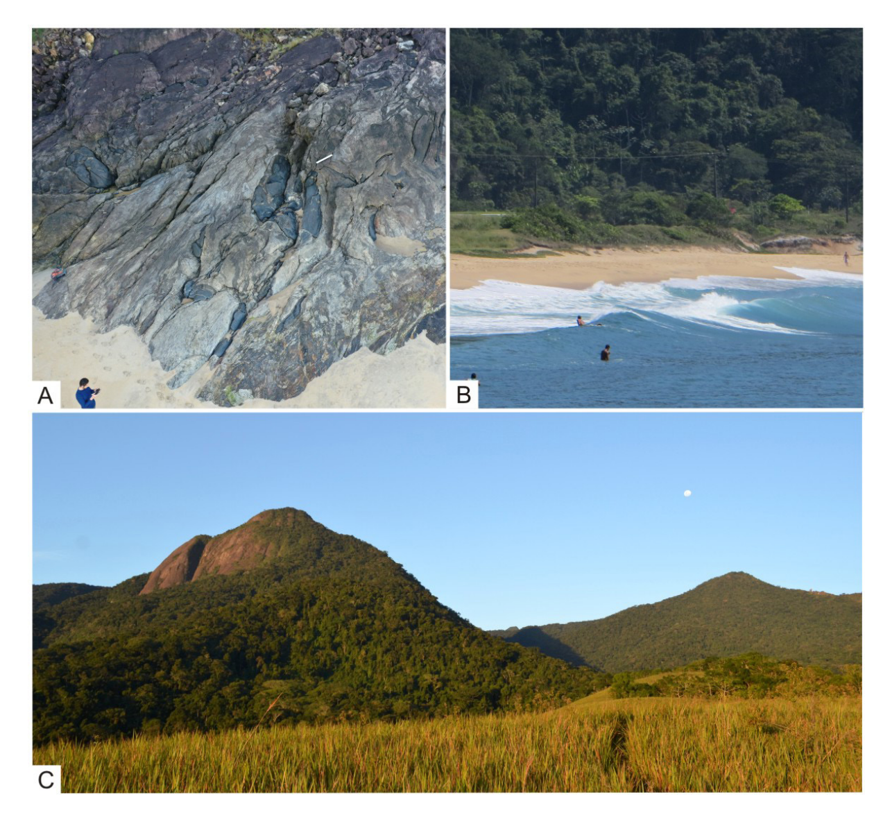
Figure 2. A) Geosite "Metatexitic Paragneisses and Amphibolites of Boiçucanga", in São Sebastião, showing boudinaged and folded amphibolitic bodies; B) Geosite "Pleistocene Marine Terrace of Praia Vermelha do Norte", in Ubatuba, with emphasis on the marine terrace with vegetation transitioning from the coastal plain to the Atlantic Forest biome; C) Geosite "Pico do Baepi", in Ilhabela, an important tourism attraction in the region.

which stands out in the landscape among Precambrian metamorphic rocks (Fig. 2C). In addition to its unique geomorphological features, the place can be reached through an ecotourism trail and acts as a viewpoint from which it is possible to observe the Serra do Mar Mountain range, the coastal plain and the Atlantic Ocean.