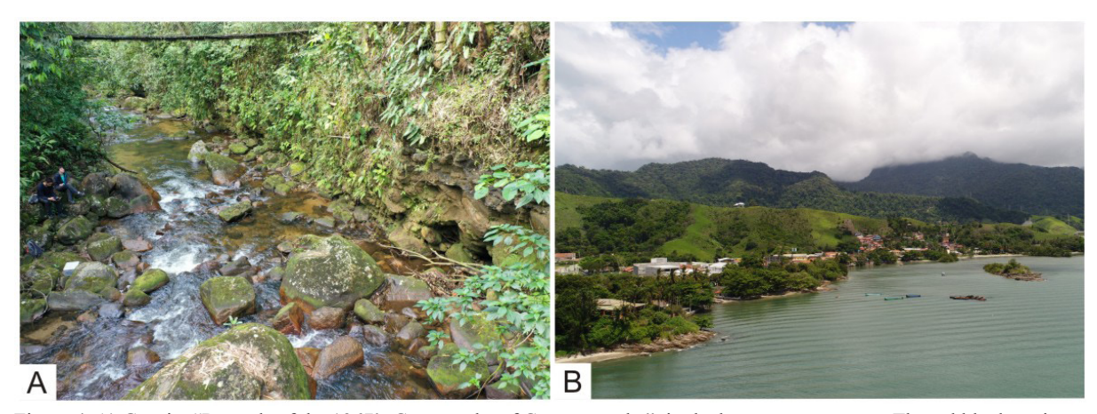
Figure 4. A) Geosite "Records of the 1967's Catastrophe of Caraguatatuba", in the homonymous town. The pebble deposits on the bank and the poorly sorted boulders along the river's course record landslides that were responsible for a great disaster in the town; B) Geosite "Dykes of Ponta do Araçá", in São Sebastião. The rocky shores (lower left) are composed of both alkaline and basaltic dikes related to the breakup of Gondwana that constitute important geoheritage. The bay sustains a mangrove ecosystem that provides habitats for several species and benefits local communities.