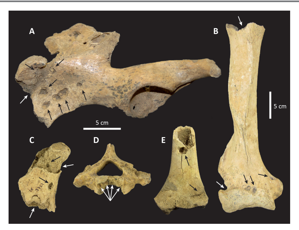
Figure 4. Examples of Ursus spelaeus bones from Coro Tracito Cave with many perforations and other teeth marks due to modifications attributed presumably to the cave bears themselves. A) adult hip, B) adult humerus, C) proximal fragment of adult femur, D) adult cervical vertebrae, E) distal fragment of juvenile femur.

Peninsula (Torres Pérez-Hidalgo 1984; Grandal d'Anglade 1993).