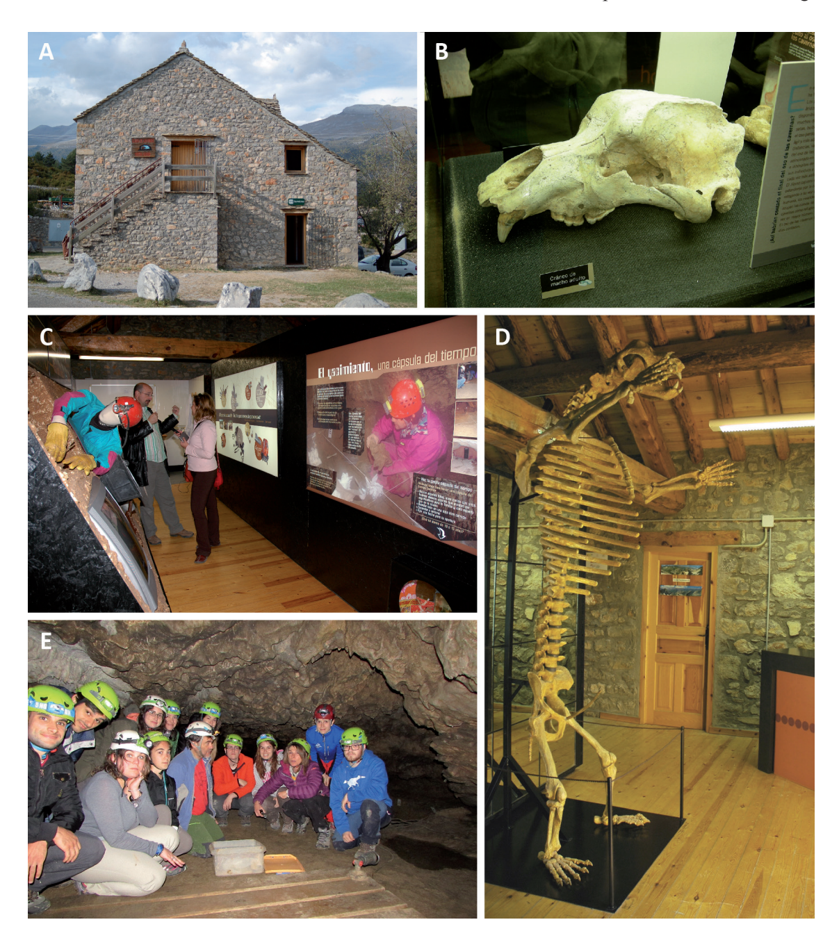
Figure 2. A–D) Tella cave bear museum (A), where several of the best-preserved bones of Ursus spelaeus from the Coro Tracito Cave are exhibited, like this cranium (B), and a life-size replica of an Ursus spelaeus skeleton (D), among other museum items (C). E) Geology students from the University of Zaragoza in the cave of Coro Tracito