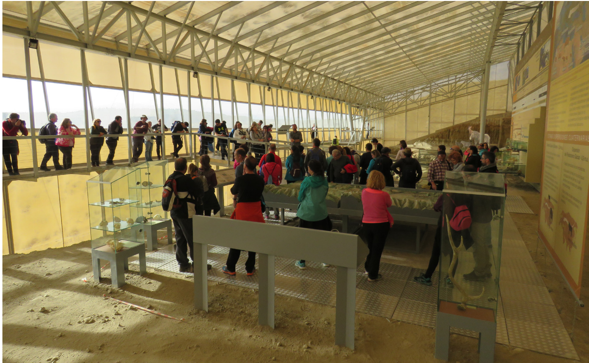
Figure 3. A guided visit to the Fonelas P-1 Paleontological Center (Fardes River Valley Paleontological Station). Between March 2017, when it was definitively opened to the public, and the same month in 2020 (covid-19 crisis) more than 10,000 people visited the paleontological site and this geological reserve.

start of the Pleistocene. Its main function is study, research, dissemination and teaching activities (Fig. 3), in the fields of paleontology, taphonomy, paleoecology, paleoclimatology, stratigraphy and sedimentology.