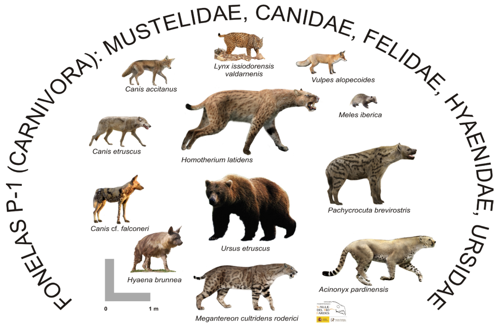
Figure 4. FoneLas P-1 Carnivora diversity. The site contains the oldest European populations of Pachycrocuta brevirostris and Canis etruscus . It features new species of jackals and badgers and the only known population outside of Africa of the brown hyena.