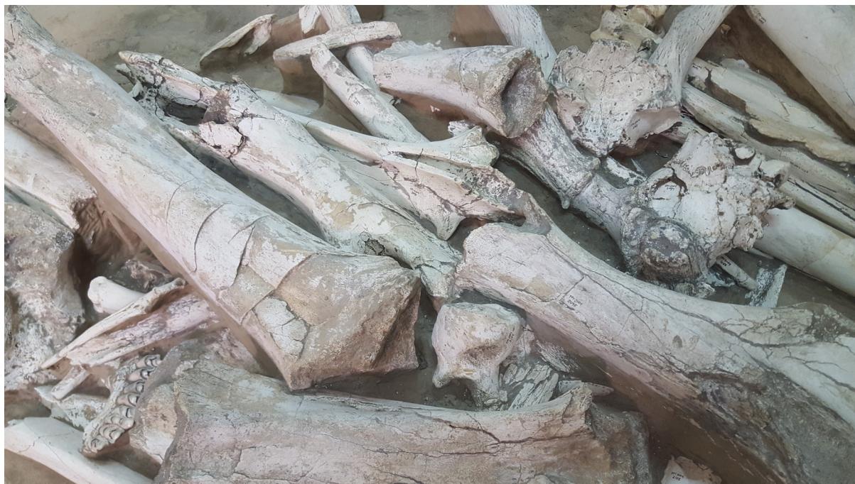
Figure 2. Set of fossilized bones characteristic of Fonelas P-1, mainly Gazellospira and Metacervoceros cranial remains and long bones, of particular interest being those belonging to young Mammuthus , all showing signs of partial consumption by Pachycrocuta brevirostris hyenas.

Through the IGME project, in 2012 the upper part of the site was prepared by earthworks (1174 cubic meters of sterile rock removed above the fossil-bearing unit, 927 m ASL), an enclosure was installed for protection from geological risks, a works plan was drawn up and technical, scientific and power supply equipment was procured to equip what would become CFPF-1.