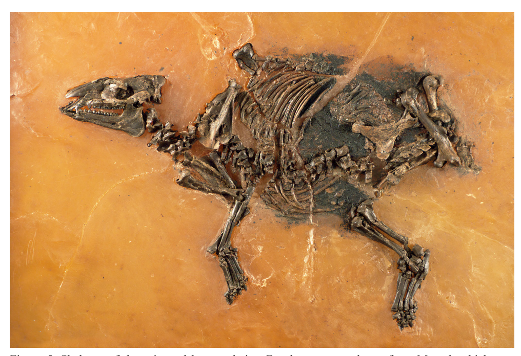
Figure 5. Skeleton of the primeval horse relative Eurohippus messelensis from Messel, which represents a pregnant mare with a foetus. Specimen in the collections of the Senckenberg Research Institute.

One of the most important things Messel has to teach us is how ecosystems functioned under climatic conditions similar to those the Earth may experience within the next 200 years (Burke et al. 2018). The species diversity of many ectothermic groups of animals is exceptional. Reptiles, for in-