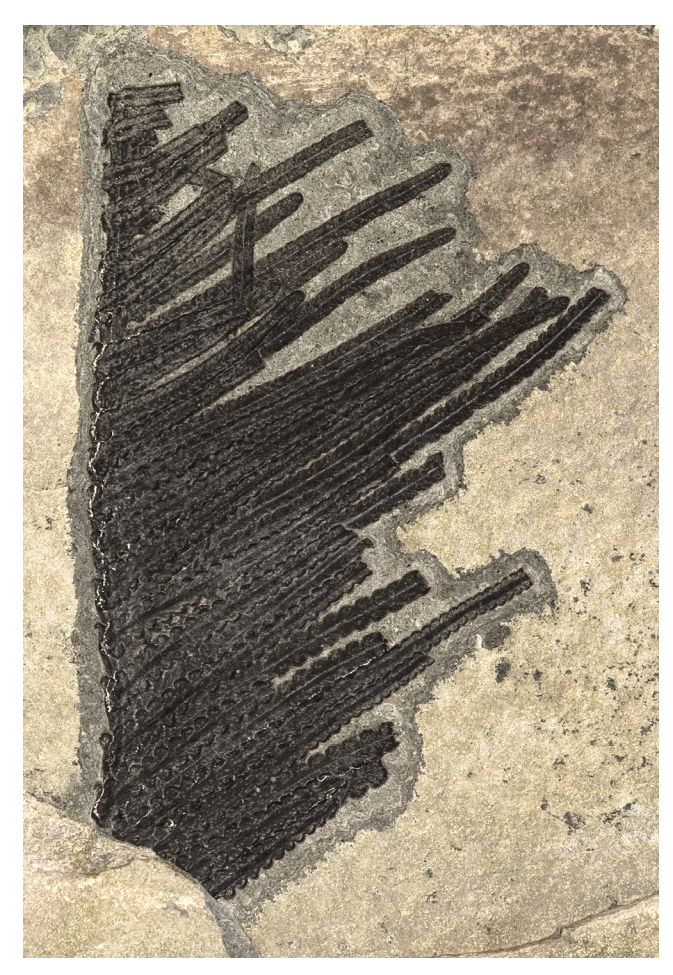
Figure 2. Fern frond from Messel. Specimen in the collections of the Senckenberg Research Institute.