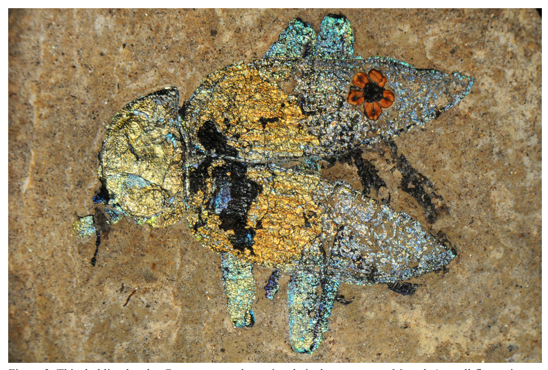
Figure 3. This darkling beetle, Ceropria messelense , is relatively common at Messel. A small flower is preserved coincidentally on one wing-cover. The beetle is c. 2 cm long. Specimen in the collections of the Senckenberg Research Institute.

The fishes of Lake Messel are extremely common but poor in species (Micklich 2012). Two groups (gars and bowfins) known from Messel were widespread in North America and Europe in the Eocene and are now confined to the warmer