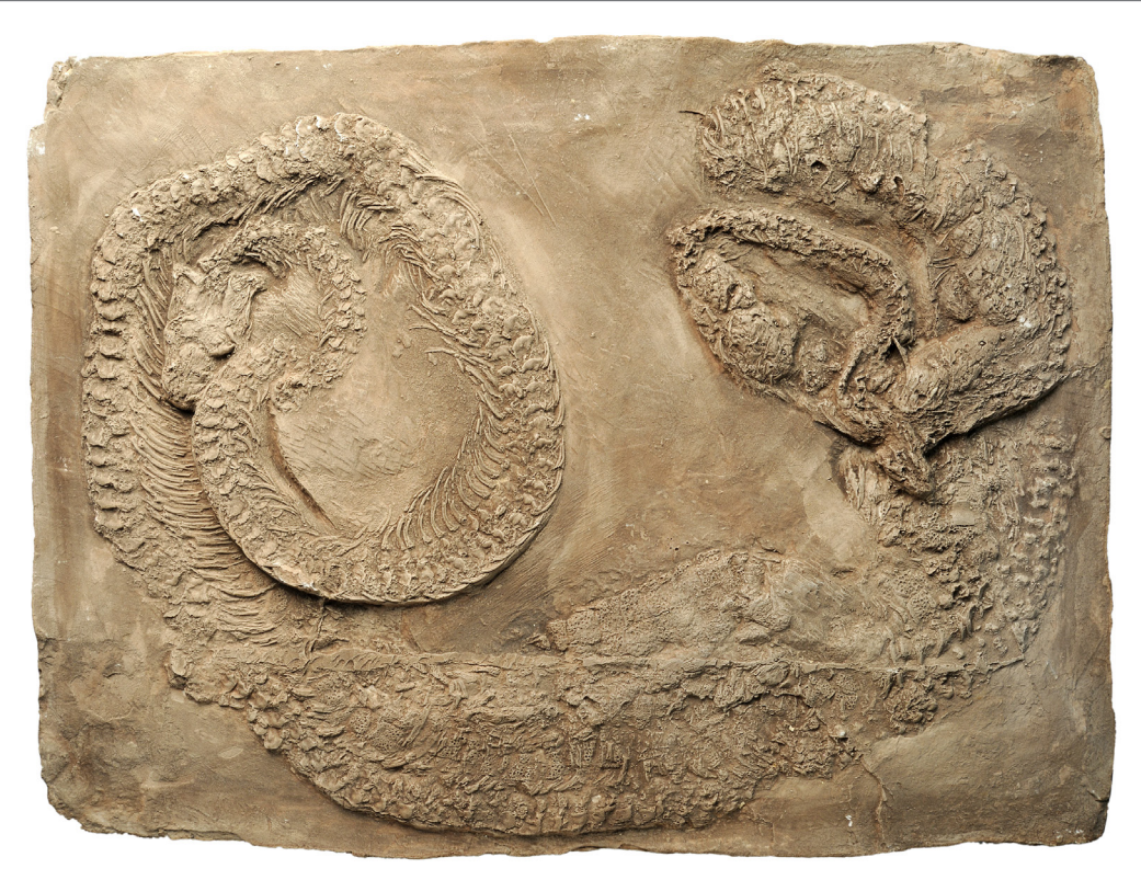
Figure 4. Skeleton of the large (2-m long) boa Eoconstrictor fischeri from Messel containing a small crocodilian. The photograph is of a cast; the original is in the collections of the Museumsverein (Museum Society), Messel.

The turtles of Messel, like in habitats everywhere today, are not particularly diverse with regard to the number of species, but they include fully aquatic species as well as semiaquatic ones (Cadena et al. 2018). Seven species of crocodilian have been discovered (Brochu and Miller-Camp 2018). Most of them are very rare and may have been only transients. However, one species, Diplocyno don darwini , is abundant and, since juvenile and adult specimens known, may have been a resident. The so-called 'hoofed' crocodile, Boverisuchus , was probably terrestrial, showing that the range of adaptations in Eocene crocodilians was much greater than today.