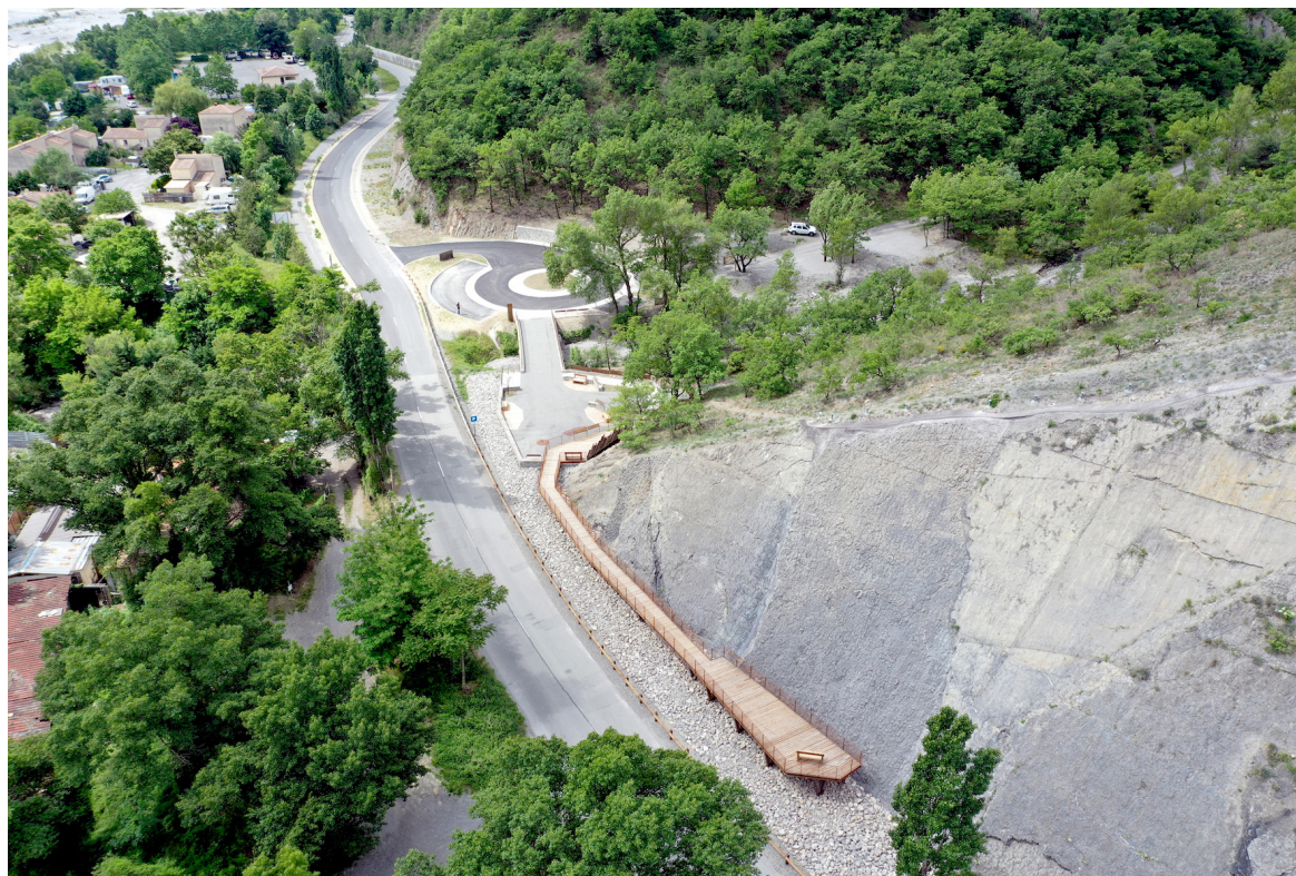
Figure 7. Aerial view of the Les Isnards site, 2020, showing the re-routed road, the parking area, viewing platform, and access for visitors with reduced mobility.