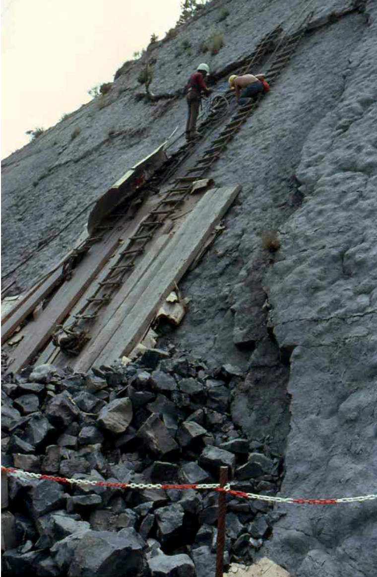
Figure 4. First geoconservation works on the slab, 1978.

to the slab and its ammonites in recent decades, led the Department and the RNNGHP to propose a protection program. This protective work was carried out by systematic anchoring with infilling of the underlying voids and fixing with steel bars, then treatment of cracks and surface holes (Fig. 5). The issue of managing water infiltration upstream of the slab was also dealt with.