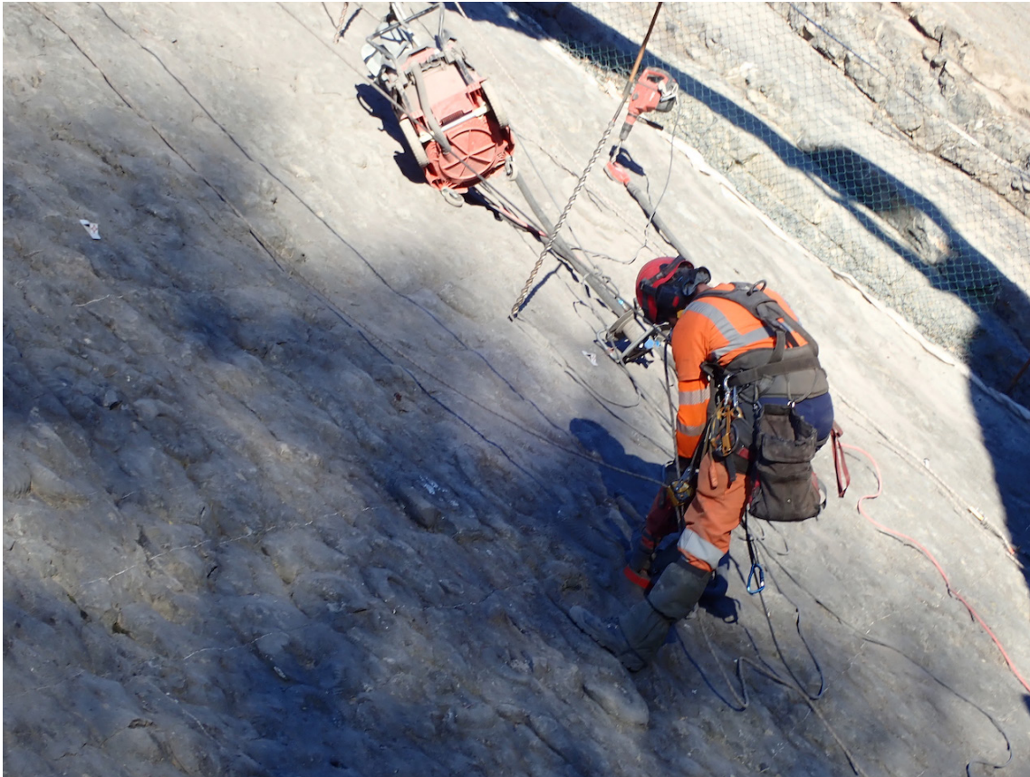
Figure 5. Drilling and anchorage of the slab, 2019.