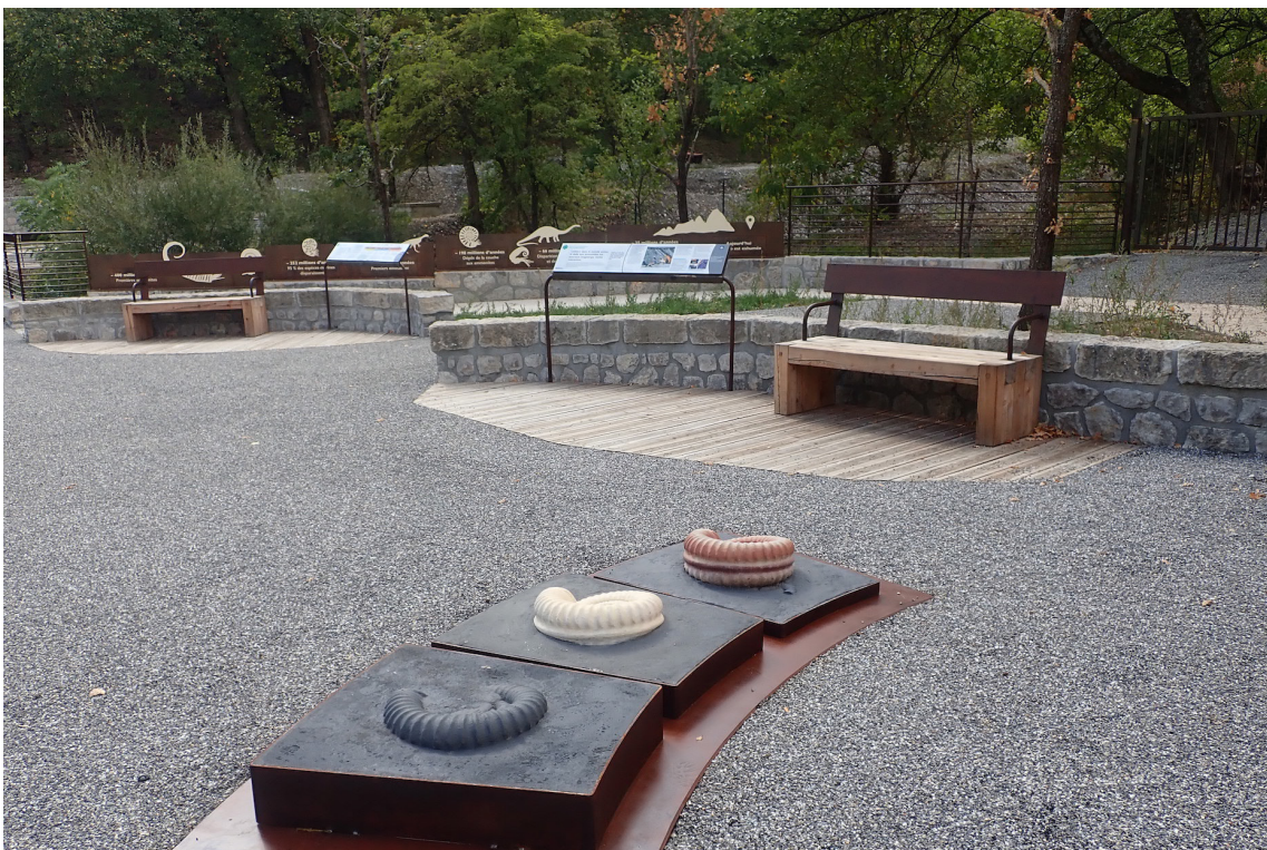
Figure 6. Some of the new interpretation equipment, 2020.