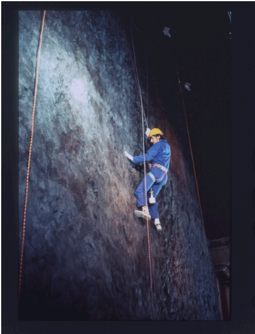
Figure 3. Installation of Ammonite slab cast in Kamaishi Museum, Japan in 1993.

The Ammonite Slab was gained international popularity even before it was known nationally. This was because of the television series Miracle Planet (Chikyu Daikiko) made by NHK in Japan in 1987. As a result of this publicity, a cast of the lower half of the slab was produced by the teams of the RN-NGHP and the Gassendi Museum (the municipal museum of Digne-les-Bains), under the direction of cast-maker René David; the cast was then installed in the city of Kamaishi (Iwate Prefecture) in Japan, where it is still displayed in a specially constructed extension of the local museum, built in 1993 (Fig. 3).