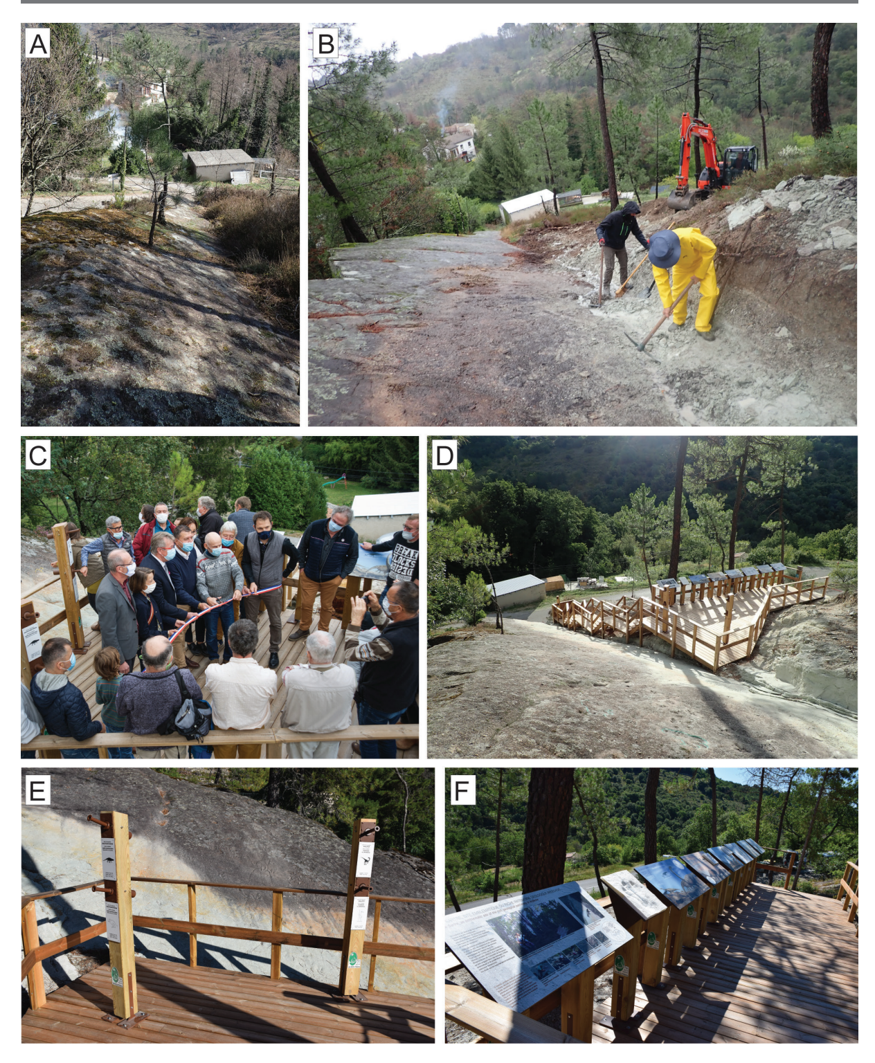
Figure 3. Installation of Le Sartre geosite. A) Aspect of the site before April 2019, as viewed from the South-West. B) Extension works carried out in April 2019 with the help of the Ucel Municipality, academics and local volunteers. The participation of scientists contributed to optimize the operation by checking track-bearing surfaces during excavation. C) Inauguration of Le Sartre geosite the 1<sup>st</sup> of October 2020. This event gathered all the actors who are contributing to the long-term project of promoting the ichnological patrimony of Ardèche. D) Aspect of Le Sartre today, as viewed from the West. E: Visual targeting tubes allowing young and adult visitors to spot well-preserved fossil footprints. F: Richly illustrated explanatory boards associated with touchable 3D replicas of representative footprints.