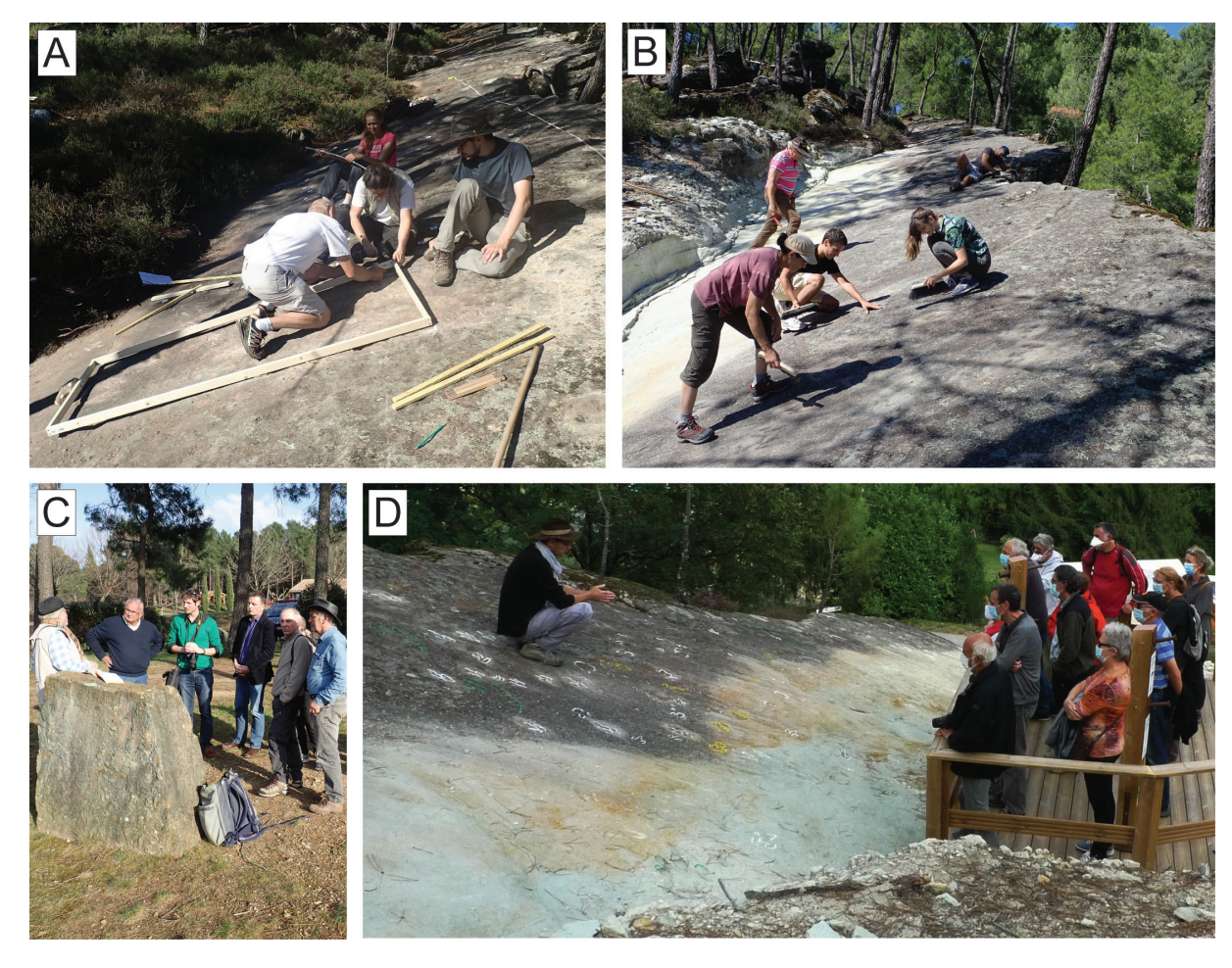
Figure 4. Diversity of actors actively contributing to the awareness of local people about the nature, richness and patrimonial value of their geological heritage. A) Preliminary scientific investigations and preparation of casts in August 2016 by a team composed of local inhabitants, master students and academics. B) Team involving local volunteers, members of the RNP des Monts d'Ardèche and academics during one of the numerous but necessary soft cleaning sessions of the track-bearing surface. C–D) Academics, members of the RNP des Monts d'Ardèche and teachers instill the notion of a universal, shared and valuable geological heritage to local people and tourists during the numerous formal and informal visits of Triassic tracksites in the Monts d'Ardèche UNESCO Global Geopark.

As expected, the Geopark label also stimulated articulation and coordination among academic actors, local associations and scholarly societies (e.g. Société Géologique d'Ardèche, association Clapas, Le CPIE du Velay), as well as local economic activities and scientific illustrators. The Monts d'Ardèche UNESCO Global Geopark is now able to offer educational toolkits, such as annual conference cycles, geosite maps, rock identification guides and geological timescales illustrated by regional features. All this material is freely available online. Services are also proposed