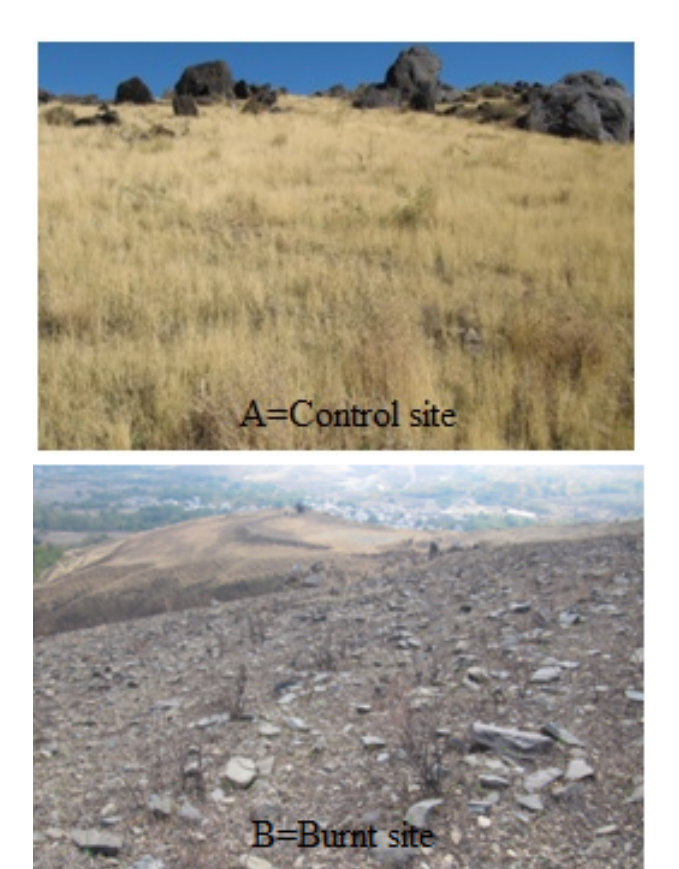
Figure 2. The study areas in the Solan region (control site: A photo and burnt site: B photo).

for 8 months from October to May and the average annual rainfall is 320 mm.