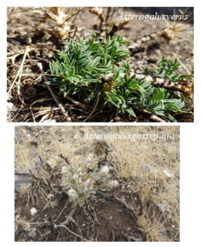
Figure 3. Regeneration of plant species in the burnt area (up picture of Astragalus verus and down picture of Astragalus gossypinus).

The fire occurred in July 2018. Vegetation sampling was performed in the July to October of 2018, 2019, and 2020. The study area was selected at two sites: A: burnt area and B: unburnt area (control) that were close to each other (Fig. 2). In each site, four transects and on each transect, 10 plots with an area of 1 \text{ m}^2 in the direction of the dominant slope were selected using a systematic random sampling method. The location of each plot was recorded and marked using GPS device. Generally, 40 plots were measured in the burnt site and 40 plots in the control area. The plant species were identified using the flora of Iranica and the Raunkiaer classification method was used to determine the biological form of plants. To determine the susceptibility of species to fire based on the qualitative classification of the Likert scale, the sensitivity was determined as resistant, semi-resistant, semi-sensitive and sensitive, and the criterion for being in each class was considered as regrowth in autumn and spring. In addition, to determine the extent of resistance of each species in the burnt area, the number of semi-burnt, living, and dead species in sample plots were recorded. Moreover, in each plot, the parameters of canopy cover percentage, litter percentage, dry matter forage production (cutting and weighing method), percentage of annual and perennial grass and forbs covers, percentage of shrubs cover, percentage of