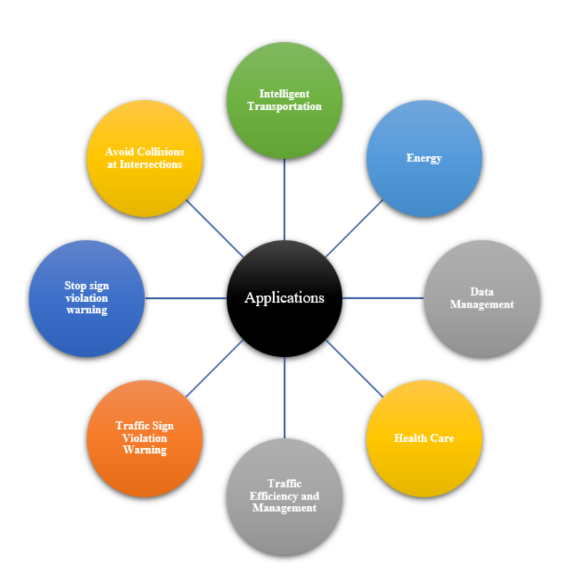
Fig 3. Green smart city applications

vehicle-based systems offer a broad, renewed, and innovative market. Researchers have proposed and tested APIs (application programming interfaces) for congestion avoidance, traffic safety, in-vehicle entertainment, and mobile services for locating, unlocking, and reading vehicle odometers across brands.