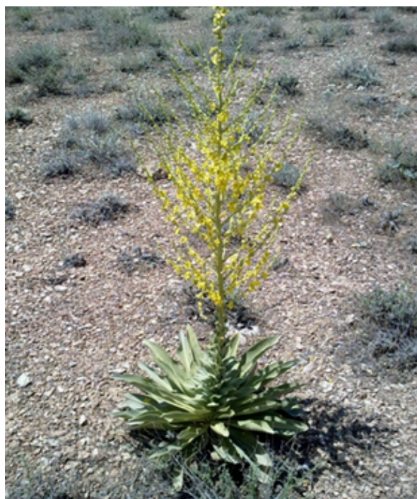
Figure 1. The photograph of the aerial parts of Verbascum sinuatum L. (Sampling area: Abr Forest, located 45 kilometers north of Shahrood, Iran).

Hydrodistillation represents a classic and longstanding method that is extensively employed for extracting essential oils from a wide variety of plant tissues. This technique has found widespread application in both laboratory-scale and industrial-scale operations owing to its reliability in yielding high-quality oils (Périno et al., 2019). Typically performed with a Clevenger-type apparatus, the process involves three main stages: heating, vapor condensation, and phase separation. Although conventional and/or classical