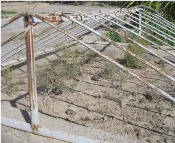
Fig. 4. Seedlings of Established in Experimental Site at the University Field

seedlings should have enough strength and reserves to survive the unfavorable conditions of new habitat.