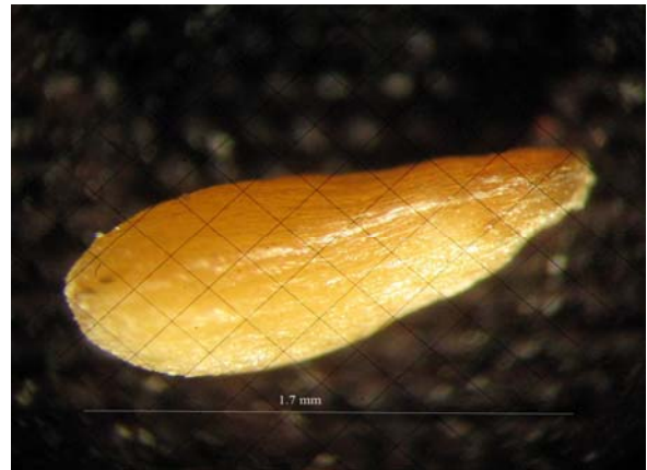
Fig. 3. Morphology of Seeds of A. sieberi from Kolah Ghazi National Park, Bar in Each Graph Indicates 1.7 mm.