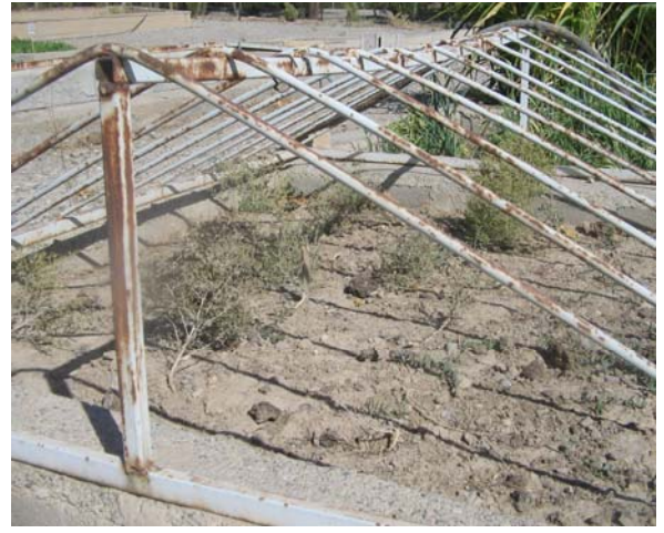
Fig. 4. Seedlings of Established in Experimental Site at the University Field

seedlings should have enough strength and reserves to survive the unfavorable conditions of new habitat.