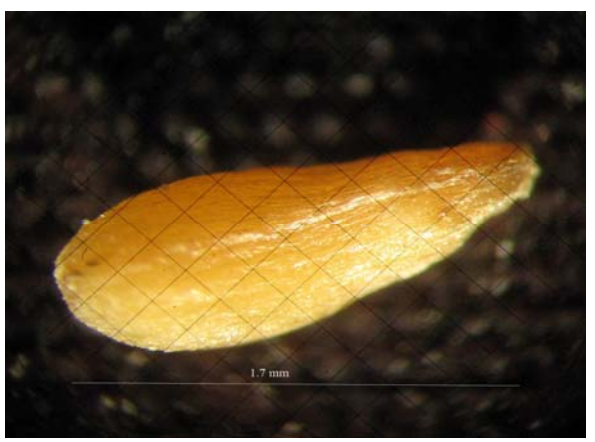
Fig. 3. Morphology of Seeds of A. sieberi from Kolah Ghazi National Park, Bar in Each Graph Indicates 1.7 mm.