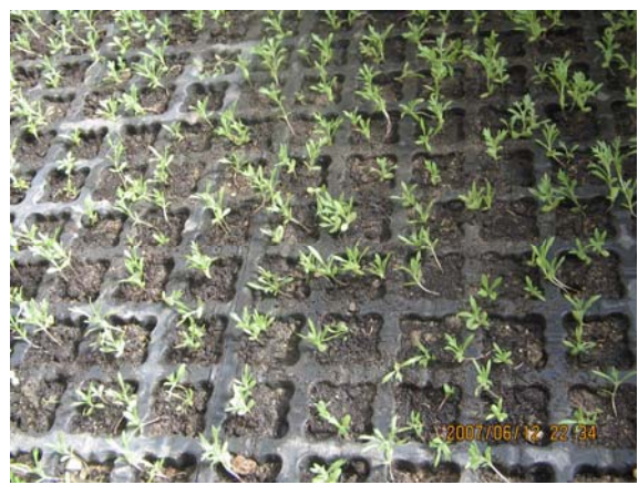
Fig. 2. Cultivation Dishes Cells (dimples) Used to Plant Seeds of A. sieberi

Two months after growing in pots, 16 plants were selected and transferred to field. University field soil and climate were similar to the habitat of seed collection site. Two months later, 16 seedlings were transferred to field soil. The sides of the pots were cut and the passage of water into the bags was open. Watering was done every 40 days. The number of the seedlings established in the field was counted and the percentage of the establishment was calculated.