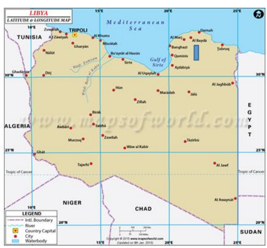
Fig. 1. The Study Area

below Zero in January and up to 35C in July and August. Fog is