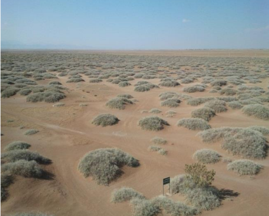
Fig. 2. A view of Nitraria schoberi type in Mighan playa