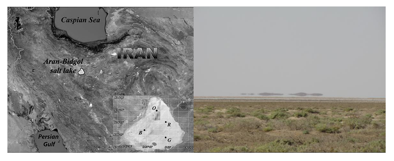
(A) (B) Fig. 1. Location of the Aran-Bidgol lake (A), marginal rangeland (B)

2009). The presence of salt and gypsum in the soil is edaphic characteristics of habitat from this plant species. The location of the studied area on the map is shown in Fig. 1.