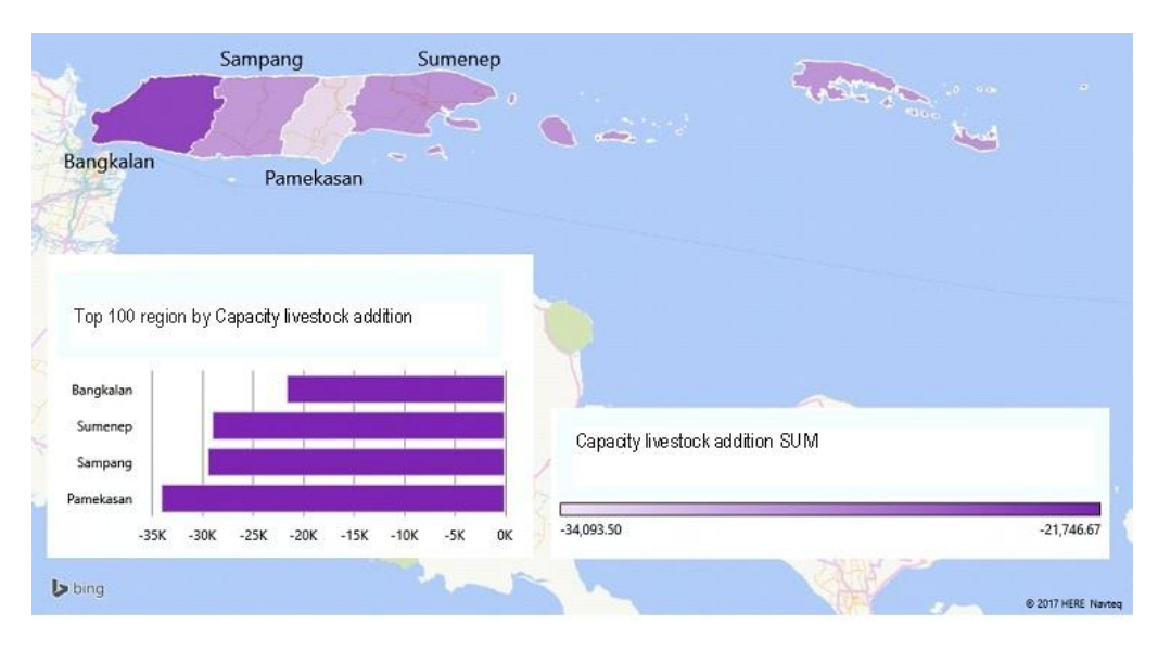
Fig. 2. Map of Capacity livestock addition for feeding