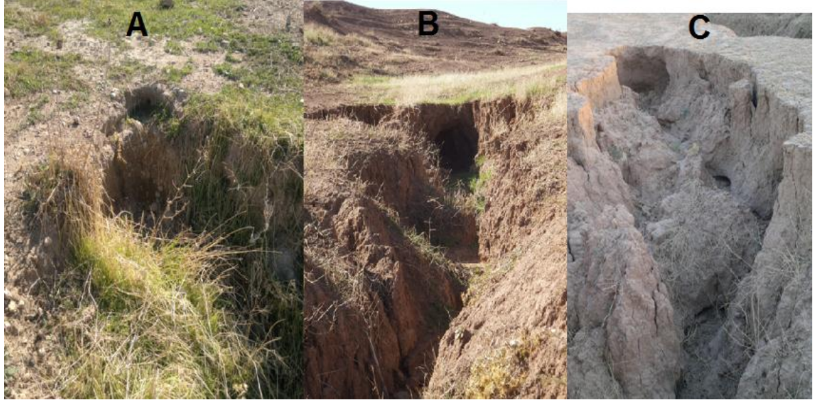
Fig. 2. Gully erosion in the study area. A= fare rangeland, B= weak rangeland and C= agricultural area

Means of rows with the same letters are not significantly different at P< 0.05%