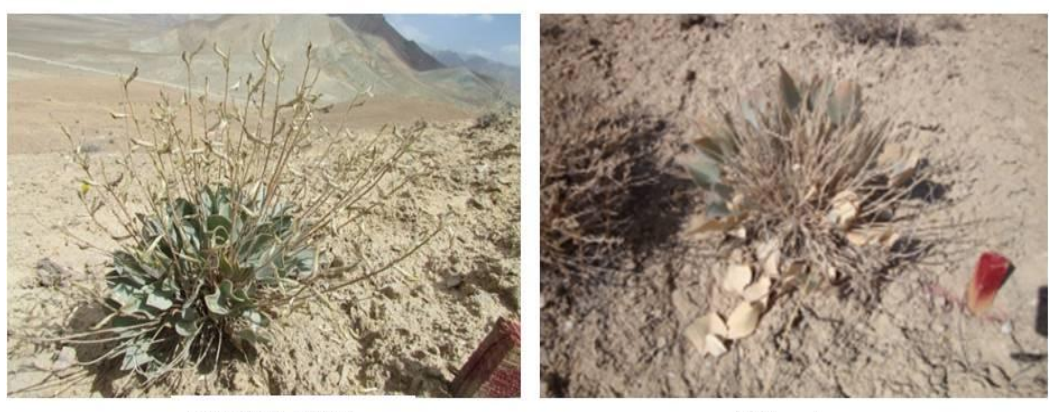
c. Seed formation