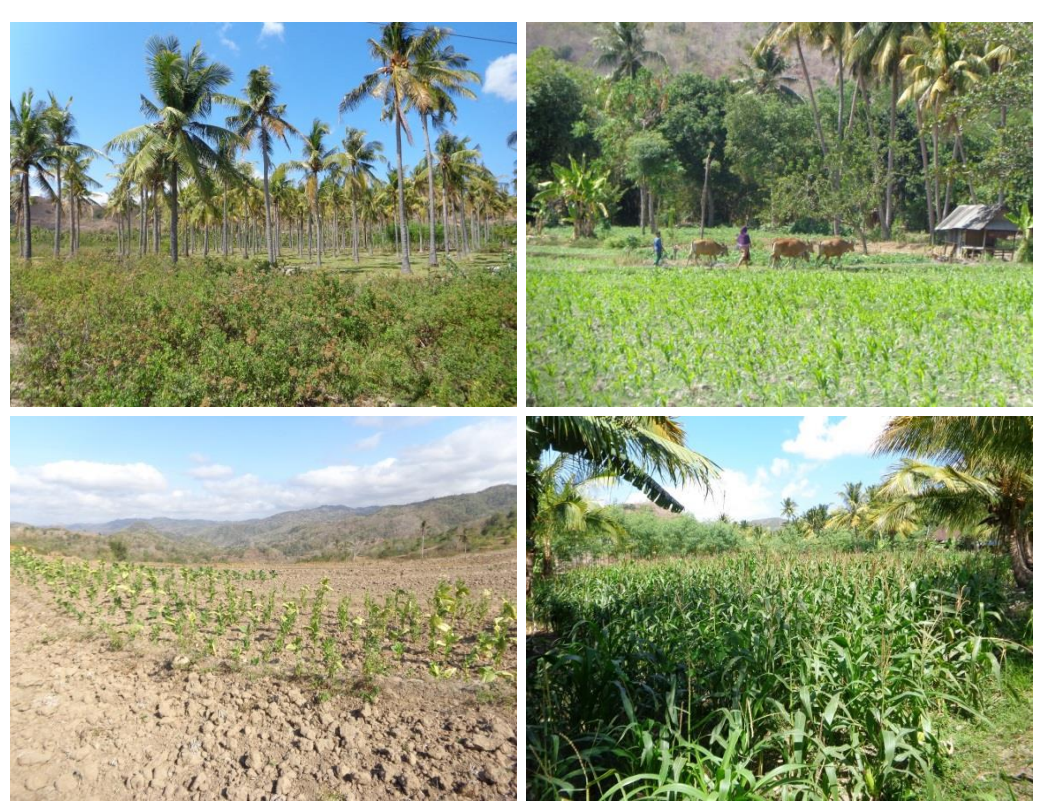
Fig. 2. Overview of the Sekotong sub-district

through in-depth interview, and the results are as follow: (1) Paddy rice and corn were the most favorable crops by the farmer; (2) farmers had 0.7-2 ha land for crop farming, and reared 3-4 cattle as their secondary source of income (smallholders); (3) most of the farmers were previously worked as gold miner; and (4) lack of farming management knowledge and technology input.