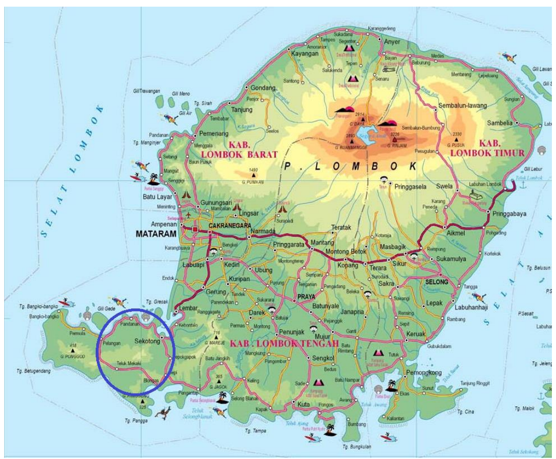
Fig. 1. The map of Sekotong sub-district marked with a blue circle (Portal Informasi Indonesia 2017, with modification)

Pelangan, Central Sekotong, Buwun Mas, Kedaro, BatuPutih, CendiManik, Gili Gede Indah, and Tamansari village (Fig. 1).