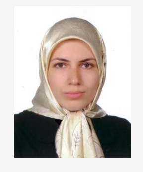
This feature focuses on a reagent chosen by a postgraduate, highlighting the uses and preparation of the reagent in current research.