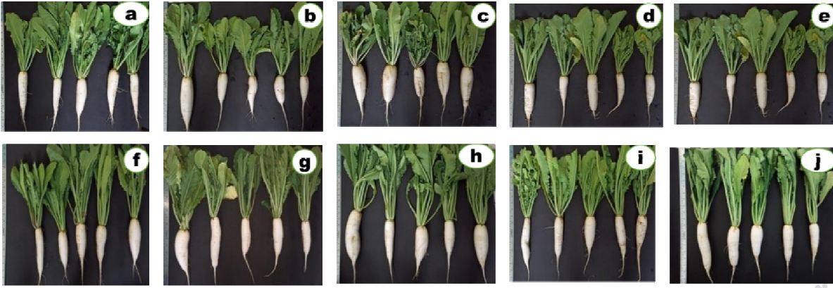
Plate 2: V2: Pusa Chetki; a: Control, b: Well rotten FYM 100%; c: Vermicompost 100%; d: Poultry manure 100%; e: Poultry manure 50% +PSB 50%; f: Well rotten FYM 75% +Poultry manure 25%; g: Well rotten FYM 75% + Azotobacter 25%; h: Vermicompost 75% + Well rotten FYM 25%; i: Vermicompost 50% + Azotobacter 50%; j: Vermicompost 50% + Well rotten FYM 25% + Poultry manure 25%