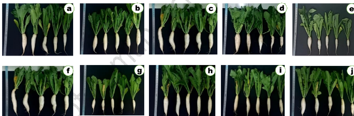
Plate 1: V1: Pusa Shweta ; a: Control; b: Well rotten FYM 100%; c: Vermicompost 100%; d: Poultry manure 100%; e: Poultry manure 50% +PSB 50%; f: Well rotten FYM 75% +Poultry manure 25%; g: Well rotten FYM 75% + Azotobacter 25%; h: Vermicompost 75% + Well rotten FYM 25%; i: Vermicompost 50% + Azotobacter 50%; j: Vermicompost 50% + Well rotten FYM 25% + Poultry manure 25%

B: C ratio: net return/ total cost of cultivation.