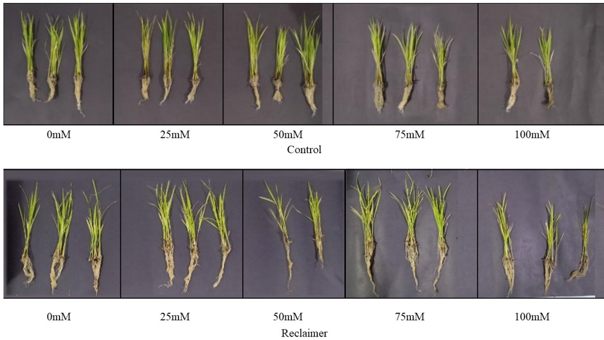
Fig 1. Effects of different salt stress levels on control and Reclaimer treatment