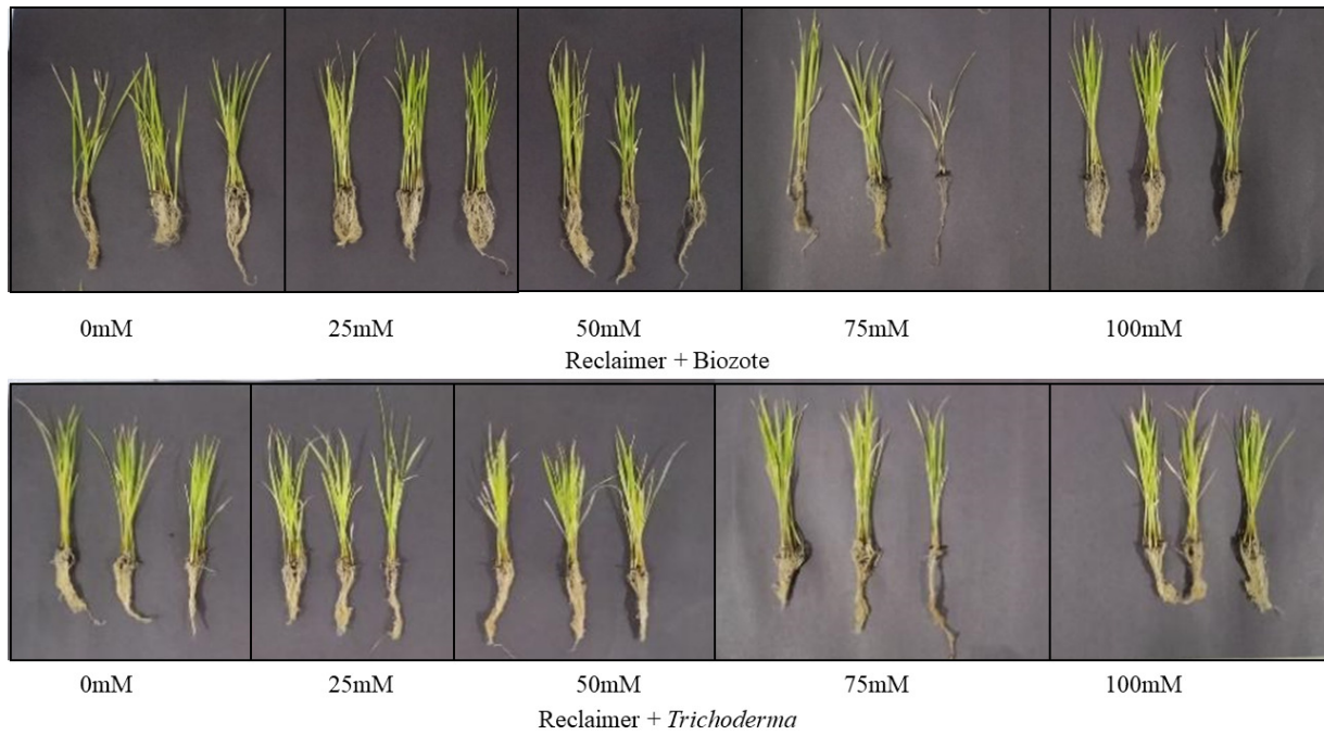
Fig 3. Effects of different salt stress levels on Reclaimer + Trichoderma and Reclaimer + Biozote treatment