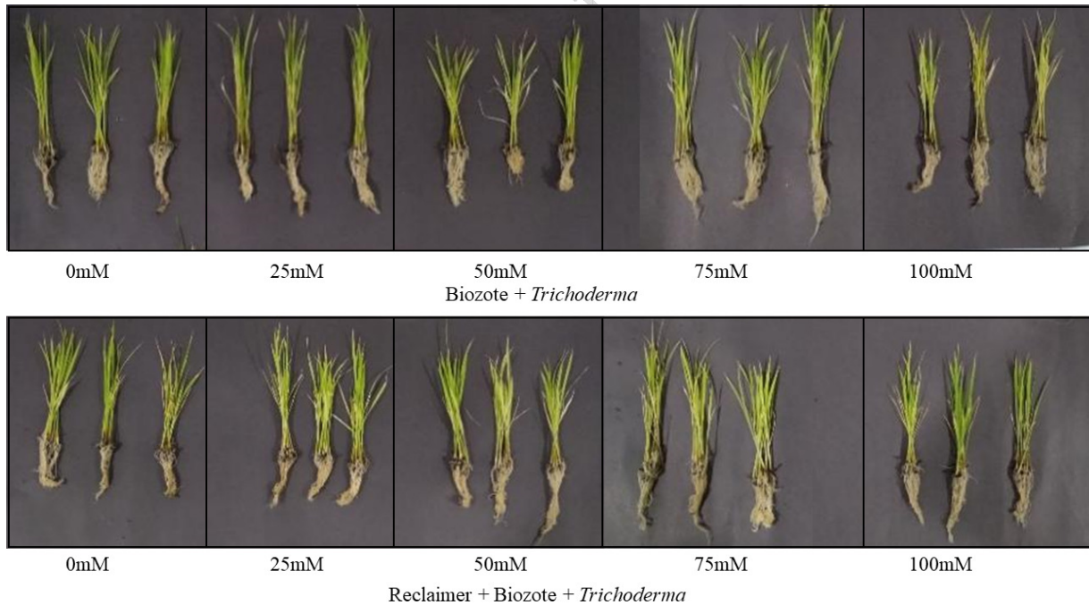
Fig 4. Effects of different salt stress levels on Biozote and Reclaimer treatment