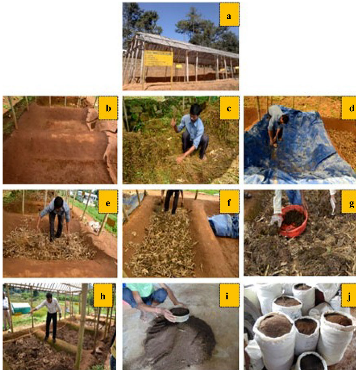
Fig. 2 Bioconversion of plant biomass into quality organic manure

protocol of Ansari (2010) was followed for biodung composting. Plant biomass was pre-digested through biodung compost technology and filled into the vermicomposting unit in a cyclic manner. Proper monitoring of temperature at regular intervals was made during composting. After every 15–20 days, the biodung compost was turned and later transferred to respective Vermitech units for composting (Fig. 2). Plant biomass (rice straw, maize stover, mixed weed biomass) was chopped (2–3 cm size) and placed with alternate layer with cow dung at 3:2 ratio. Treatments, viz., control (plant biomass + cow dung), plant biomass + cow dung + earthworm (with poly lining), plant biomass + cow dung + earthworm (without poly lining), plant biomass + cow dung + earthworm + CDM (with poly