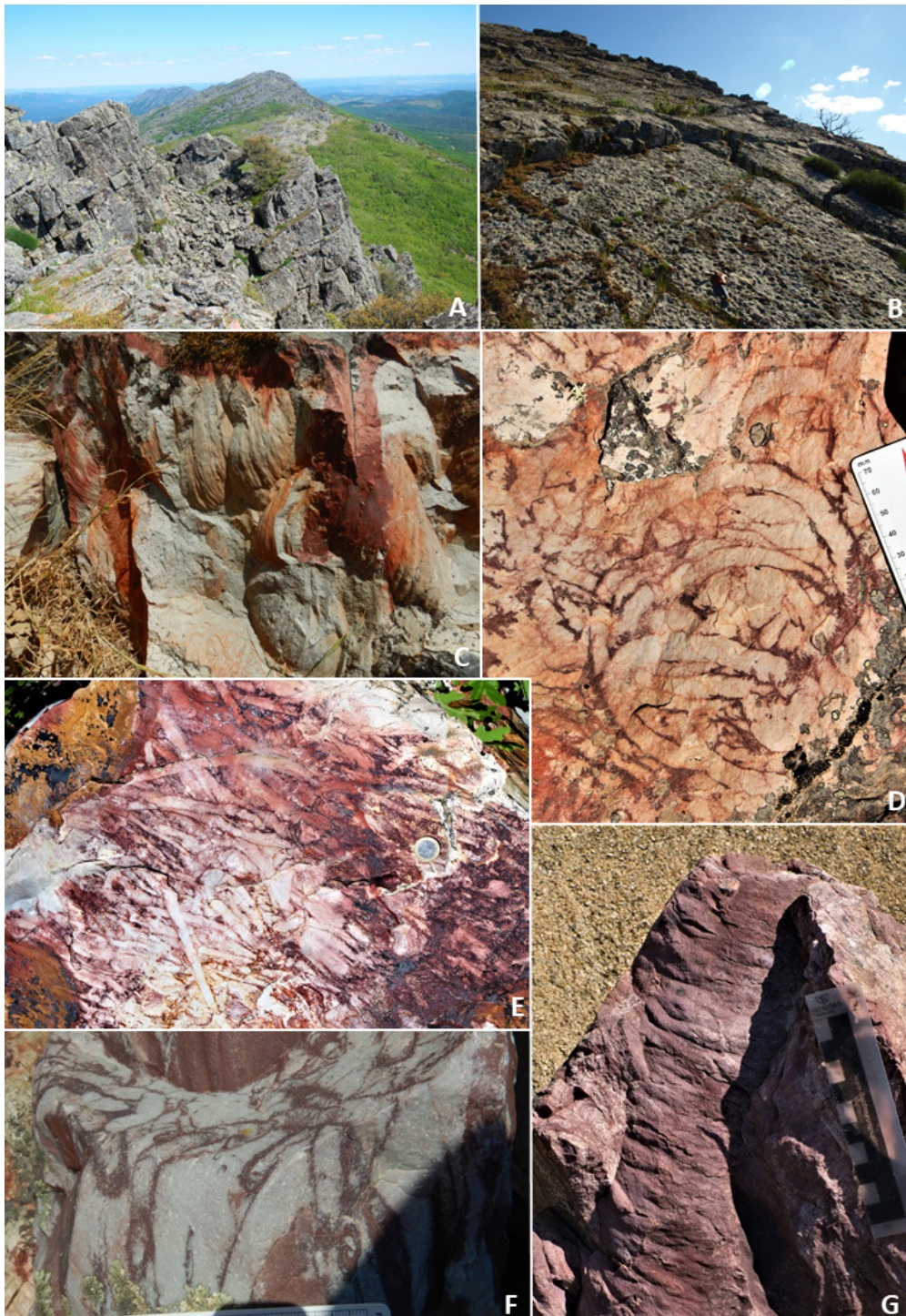
Figure 3. Risco Carbonero, the main Daedalus mega-ichnosite from Villuercas-Ibores-Jara UNESCO Global Geopark. A) General view of the succession exposed on the top of the mountain. B) Bedding plane showing the typical dense ichnofabric. Black scale is 15 cm. C) D. desglandi , with different spindle-shaped burrow complexes in cross section, evidencing the exceptional preservation of these trace fossils at the geopark. D) Cross section parallel to bedding of one of the D. desglandi burrow complexes showing the chaotic filling of the available eco-space with successive protrusive and outward expanding burrow bands. E) Dense vertical burrowing with many intersections of previously utilized areas. Coin as scale is 23 mm. F) Sediment disruption heterogeneities produced by burrow translocation and changing of tier, highlighted by post-lithification oxidation. G) Deviation of the heli-cospiral coiling behavior to a Zoophycos -like pattern.