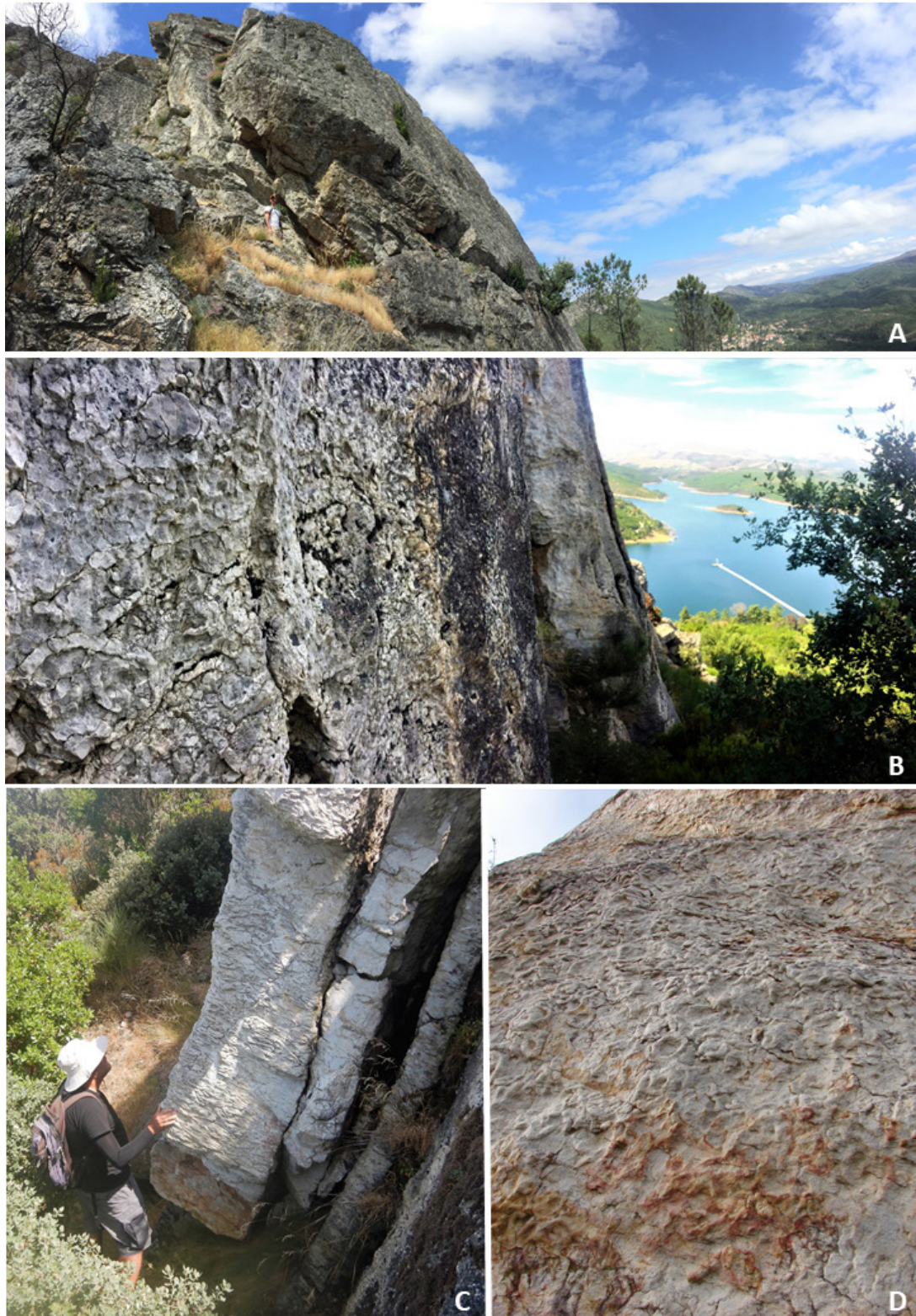
Figure 2. Muradal-Fajão syncline where the main Daedalus mega-ichnosite in the Naturtejo UNESCO Global Geopark is found. A) Basal bed soles crowded with D. desglandi at Cardal, Muradal Mountain. B) The same bed as A at Santa Luzia dam, 20 km NW from Cardal and showing the same dense ichnofabric. C) Cross section of the bed in B showing D. desglandi disrupting completely the primary fabric. Almost all the overlying beds show crowded D. desglandi ichnofabrics. D) Bed sole view of the D. desglandi ichnofabric at Portelo geosite, showing the dense distribution of spirally coiled burrow complexes, up to 30 cm wide (see Neto de Carvalho et al. 2016).