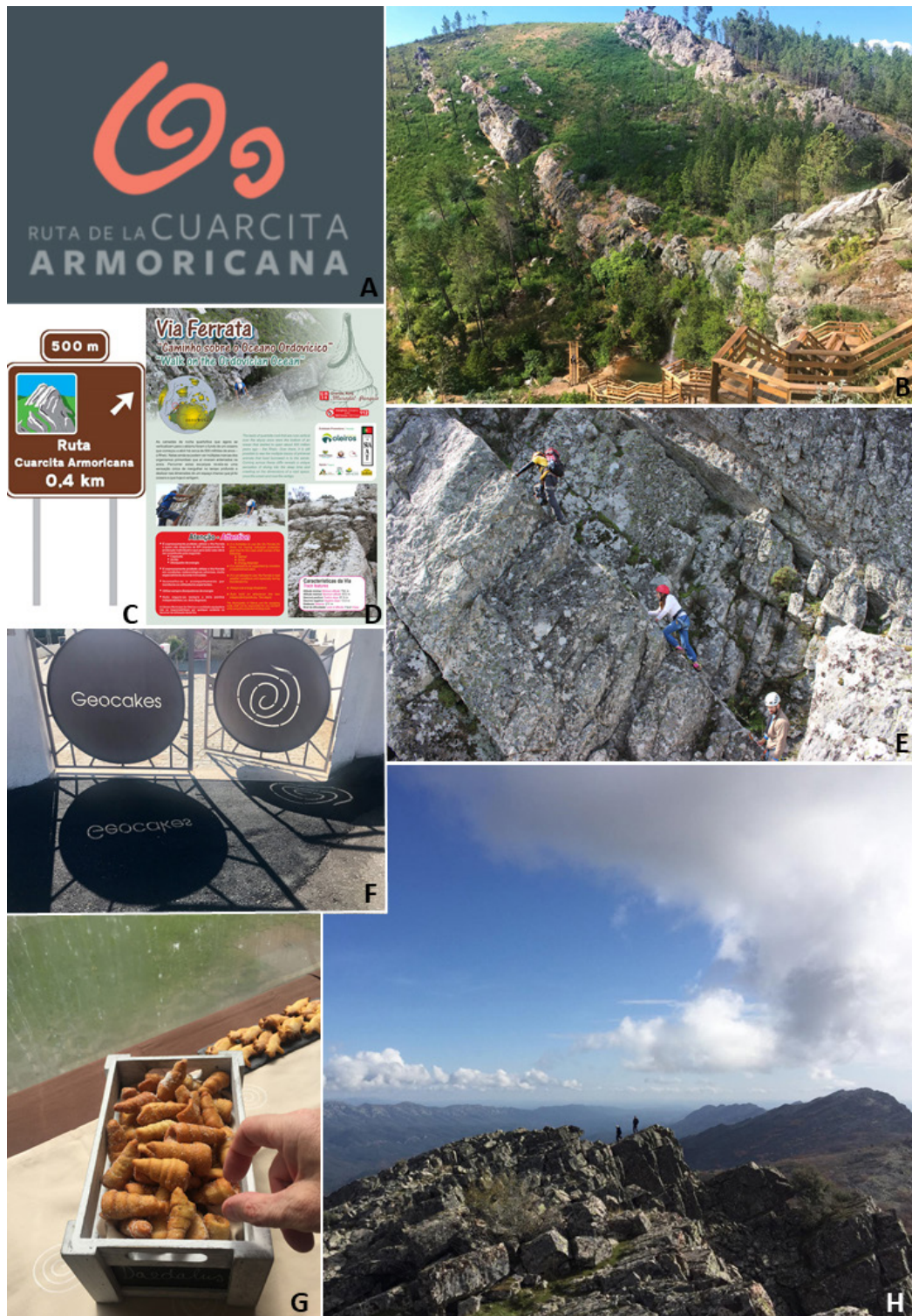
Figure 5. The Armorican Quartzite Route uniting by road Villuercas-Ibores-Jara and Naturtejo UNESCO Global Geoparks. A) The symbol of the route is inspired by the Daedalus spiral preservation on bedding planes. B) Orvalho GeoTrail at Naturtejo is one of the attractions that the Armorican Quartzite Route will connect. C) Road signs planned for the identification of the route. D) International Appalachian Trail panel with the Daedalus as identity symbol, Naturtejo. E) Via Ferrata “Walking on the Ordovician Ocean” at the Muradal mountain, Naturtejo. F and G) The Geocakes company, a partner of Naturtejo, with shop and cookies inspired by Daedalus . H) Training sessions with geoscientists in geosites for partner companies of Villuercas-Ibores-Jara Geopark.