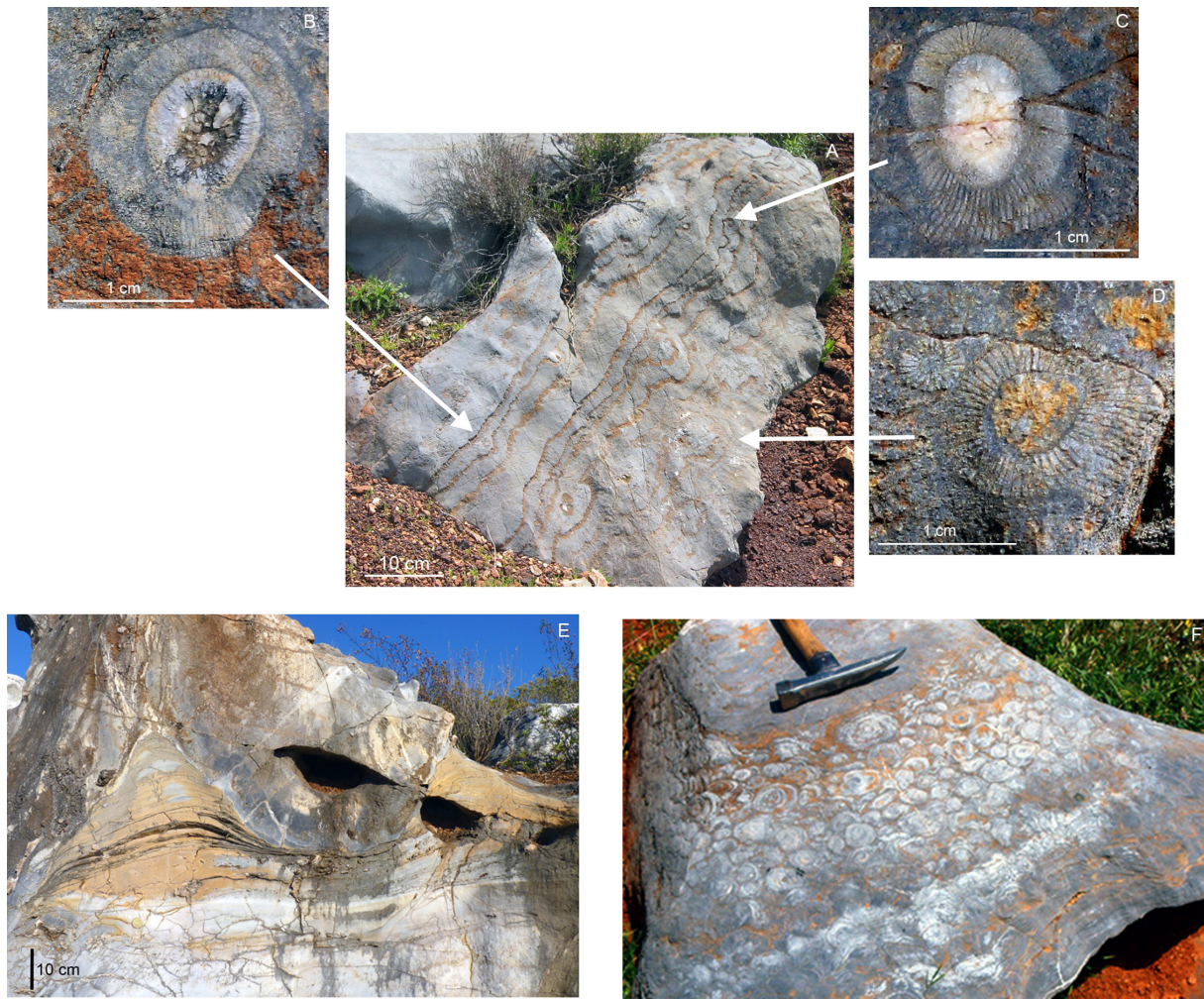
Figure 2. Limestones of the Campoallá series. A) Laminated limestone with cross-sections of archaeocyaths (B–D). E–F. Stromatolitic limestone. E) Isolated vertical buildups. F) Front-side sections of a large group of stromatolites with nearly horizontal growth axes.

subumbrellar (Fig. 3A–C) and exumbrellar (Fig. 3C–D) sides of the jellyfish and they even show overlapping relationships between them (Fig. 3C).