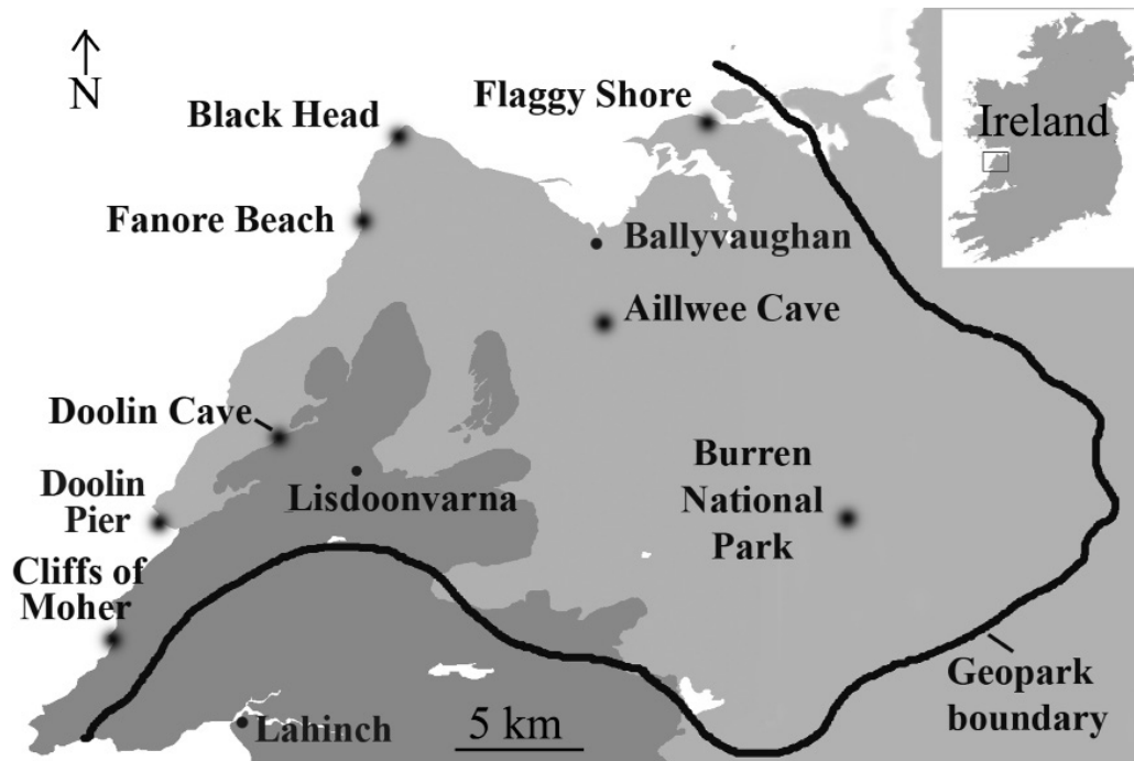
Figure 1. Location map showing sites mentioned in text and simplified geology: light grey = Mississippian limestone, dark grey = Pennsylvanian siliciclastics.

and a brief consideration of the potential risk to public exposure.