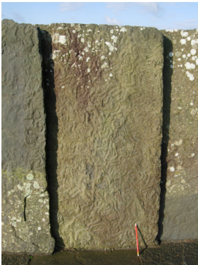
Figure 2. Wall slab on walking trail with abundant Psammichnites trace fossils at the Cliffs of Moher. Pencil = 15 cm

highly unlikely to be removed by visitors.