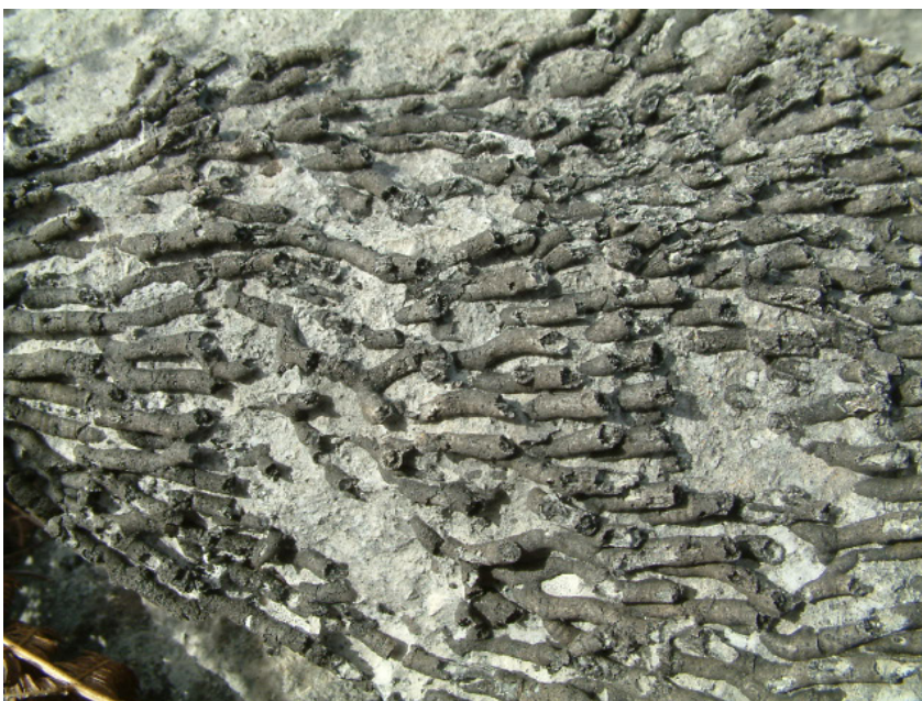
Figure 4. Silicified colonial coral on walking trail, Burren National Park. Maximum diameter of colony = 60 cm

limestone. There is some wear from footfall along the walking path in the Burren National Park.