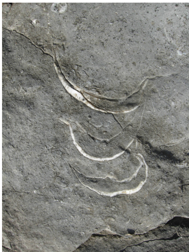
Figure 5. Brachiopod shells, Burren National Park. Maximum length = 10cm

interest and the difficulty in extracting them from the hard limestone.