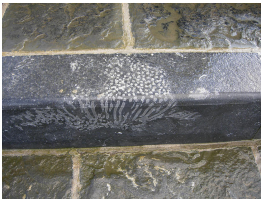
Figure 3. Corals in the steps at the Cliffs of Moher. Step height = 15 cm