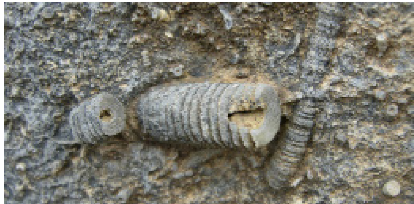
Figure 7. Crinoids, Fanore Beach. Length of vertical stem section = 5cm

These have been struggling C-list celebrities for a long time, but the new research has given them some new fans and they could become B-list celebrities before long. Crinoids are very low risk because of their huge abundance and the difficulty in extracting them from the limestone.