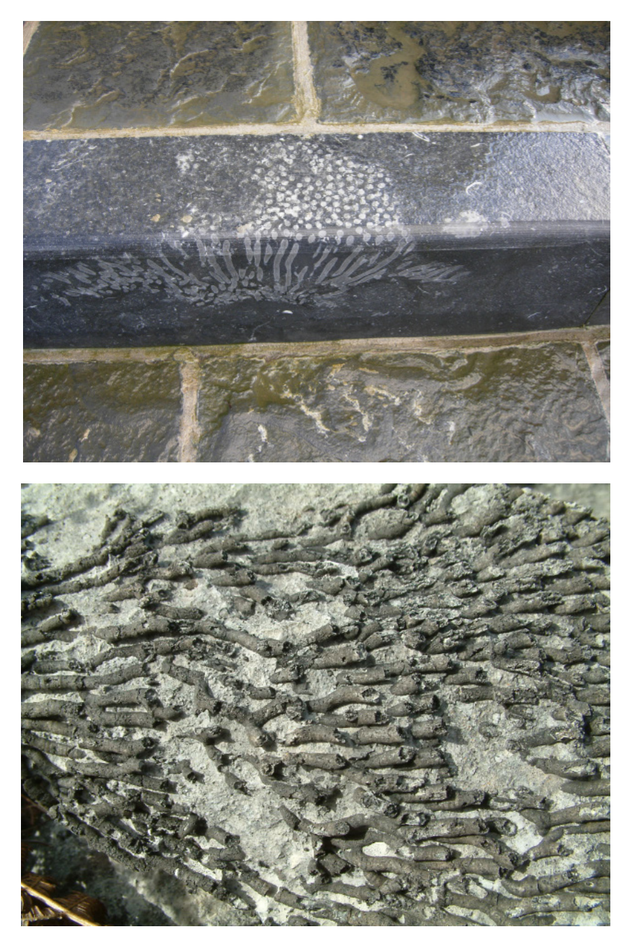
Figure 3. Corals in the steps at the Cliffs of Moher. Step height = 15 cm