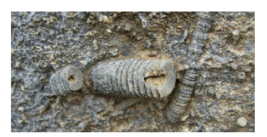
Figure 7. Crinoids, Fanore Beach. Length of vertical stem section = 5cm

These have been struggling C-list celebrities for a long time, but the new research has given them some new fans and they could become B-list celebrities before long. Crinoids are very low risk because of their huge abundance and the difficulty in extracting them from the limestone.