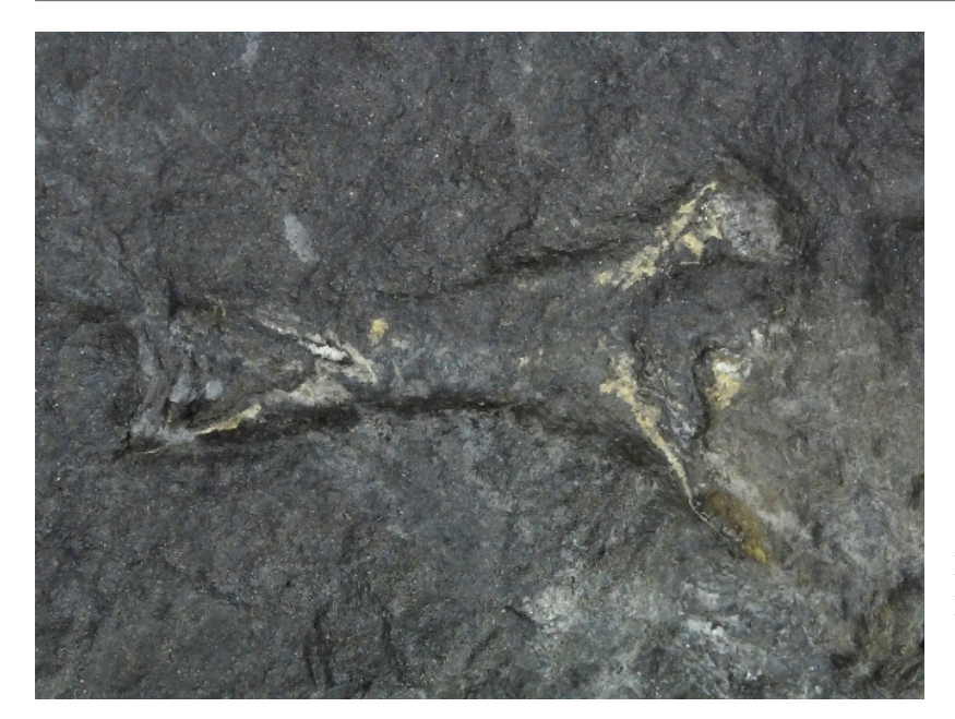
Figure 8. Vertebrate bone, Doolin Pier. Length of bone = 1 cm

use of a reconstructed Pennsylvanian tetrapod image (courtesy of Scottish Museums) which gave life to the otherwise insignificant looking material (Fig.8).