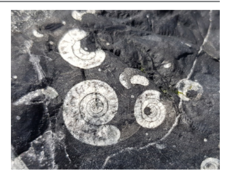
Figure 6. Ammonoids, Doolin Pier. Maximum diameter = 2.5 cm