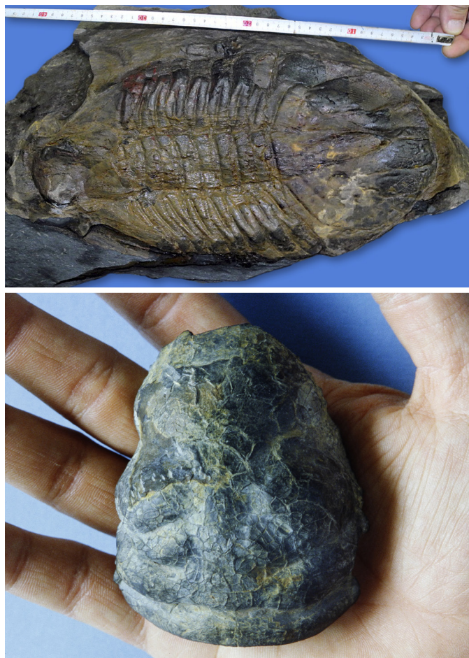
Figure 3. Some giant trilobites from the middle Darriwilian of the Toledo Mountains (central Spain), demonstrating the lateral stratigraphic continuity of the particular trilobite bed of the Valongo Formation more than 400 km eastwards –see Fig. 1. Above, a specimen of Ogyginus forteyi Rábano 40 cm long, slightly affected by diagenetic compaction, from the locality of Ventas con Peña Aguilera (province of Toledo). Below, an isolated glabella preserved in full relief, of a huge specimen of Hungioides bohemicus (Novák in Perner) from Navas de Estena (province of Ciudad Real). Specimens and pictures from Alejandro Navarro/Timoteo López and Museo Geominero (Madrid), respectively.

A final observation refers to the famous ‘gigantism’ of many species from the Canelas quarry. If we compare the size of the specimens in Arouca to those of the same species in other comparable middle Darriwilian assemblages from the Toledo Mountains (Spain), it is striking that not only does the size of the trilobites exceed the normal dimensions of Spanish specimens, but the same happens to the adult specimens of many brachiopods, gastropods, bivalves and hyolithids, among others. Gutiérrez-Marco et al. (2007) argued that the giant trilobites of Canelas were affected by a cleavage parallel to bedding, which produced an increase in their dimensions. Later, Gutiérrez-Marco et al. (2009) estimated that tectonic deformation could have produced length increases by up to 15%. But these estimates are difficult to confirm because the