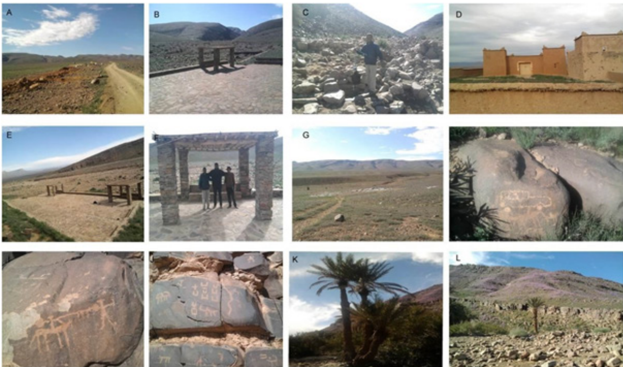
Figure 3. View of site of Foug Chenna. (a) The road to the site; (b, e, f) The new interpretation Centre built by the Moroccan Ministry of Culture and some Executive Board of the association; (c) This well, dug in 2013, with a depth of 10 meters, allows tribes, nomadic or sedentary, to maintain their traditional way of life. Equipped to draw drinking water, it also includes a trough for animals (camels, goats, and sheep) in the region or in transhumance; (g, h) threat of destruction by human activities (disfigurement and rubbish); (i, j) Selection of engravings from Foug Chenna (Horseman, leopard/lion, Libyco-Berber letters, animals, ostrich, etc) and; (k, l) Natural landscape in the Foug Chenna (date palms).

The mounted horse and the ancient Libyan alphabet are important elements for the establishment of a chronology of Moroccan rock art (Searight 2001; Heckendorf 2008 a, b), discovering and applying new techniques to understand motif styles and their chronology is necessary for the Foug Chenna site (For more information about the methodology for dating the rock art, see Bednarik 2002). Both pecked and polished techniques were used. Patination varies from complete (the same color as the supporting rock) through medium to fresh. In general, the engravings are small, 30-50 cm. No image larger than 1 m was noted (Bravin 2014). Not far from Foug Chenna site, there are two other sites in the area, in the same style and the same period, namely Assif Ouigane and Jorf Al Khalil (Fig. 2). The latter contains about a hundred engravings, mainly of horsemen, horseshoes and jewelery, including fibula and little circles which could be interpreted as bracelets (El Graoui 2005). The last advances in the studies of Foug Chenna rock art (e.g., Abioui et al. 2018; Beraaouz et al. 2017; Bouzid et al. 2012; Beraaouz 2011) provide additional and better data, which are also taken into consideration in this study. The Foug Chenna locality is an excellent example of a rock art site which has been very effectively interpreted for public viewing, geotourism and geoeducation.