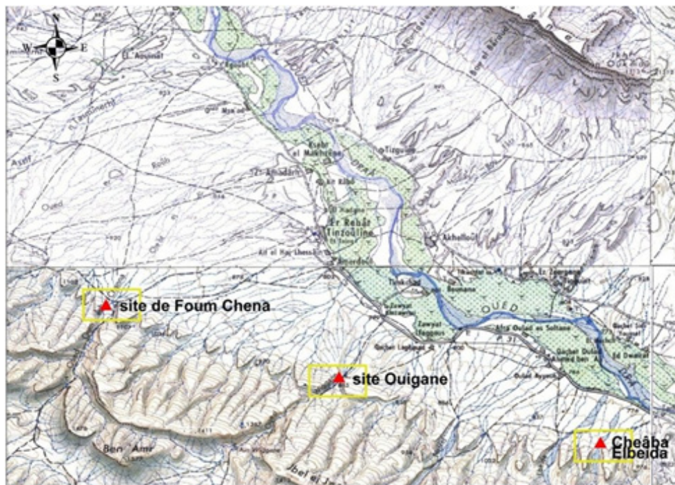
Figure 2. Location of the rock engravings sites of Tinzouline (Topographic map of El Gloa, scale 1/100,000) from Beraouz (2011).