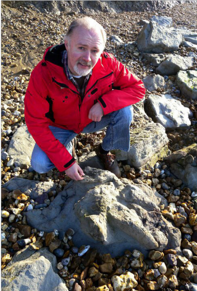
Figure 8. Theropod footcast at Brook Bay, subsequently eroded.

Fewer tourists are spending less time on the Island, with a trend for shorter breaks. This decline has resulted in a corresponding decrease in the number of tourist attractions, fewer ferry crossings, fewer bed spaces and a radical change in consumer spending. Retail businesses have suffered, as have traditional pay-to-enter attractions, but another, positive trend is evident; there has been a notable increase in activities such as walking, cycling and guided tours, including fossil hunting trips. Similarly, visits to pubs, coffee houses and cinemas are also on the increase. Despite falling visitor numbers, the last 15 years or so have seen several additional fossil shops being set up on the Island. Apart from the two longest running fossil businesses at Godshell and Yarmouth, there are new fossil shops at Ryde, Brighthstone, Newport and Shanklin. Shanklin old village is the base for two gift shops, one of which is run by the self-styled 'Jurassic Jim', who describes himself as both fossil hunter and legend (Isted 2016). Other, general gift shops also sell fossils, mostly imported from Morocco or Madagascar. However, the contrast between customer spending in retail outlets and on activities is a stark one. Whether these shops will all survive in the current financial climate remains to be seen.