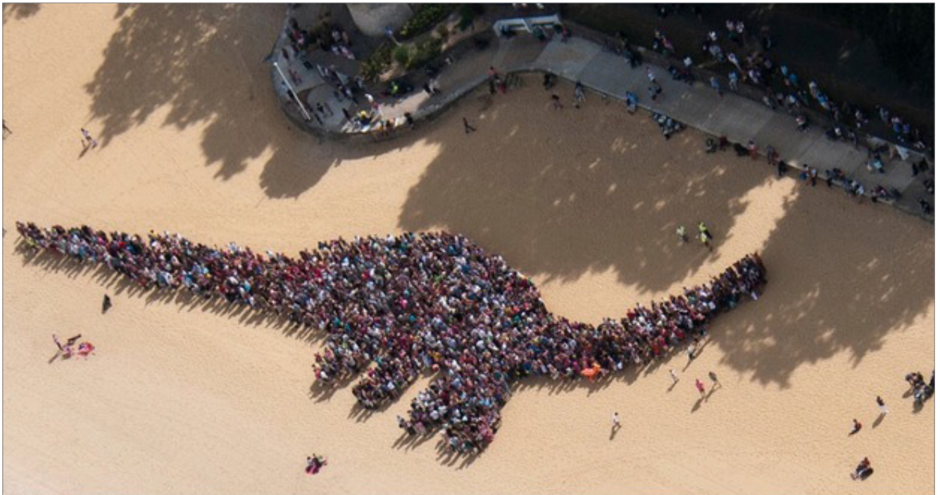
Figure 9. Aerial view of The Big Dinosaur event 2013, a human dinosaur shape, at Appley beach in Ryde.

The Isle of Wight's geological heritage is unique, and the Dinosaur Island moniker is a good marketing slogan. The Island's proximity to the Jurassic Coast and the universities of both Portsmouth and Southampton provides good research opportunities. In specific terms, a feasibility study could be undertaken into the viability of a field studies centre to complement, rather than compete with, Dinosaur Isle. This might take advantage of the growing number of visiting primary schools, family based fossil trips and educational groups. Such a centre might provide not just accommodation for this market, but also an exhibition space to display finds made by local collectors, most of whom would prefer their material to stay on the Isle of Wight. Other suggestions dealing with issues of ownership were discussed by Simpson (2001). Recent collaborations between collectors and Visit Wight, the Island's new tourist organisation, have been successful, for example the 'Year of the Dinosaur' campaign and the 'Big Dinosaur Event', both taking place in 2013 (Fig 9). Above all, a spirit of cooperation and respect should be encouraged between all professional and amateur palaeontologists who collect on this Island, a place often described as a geological paradise.