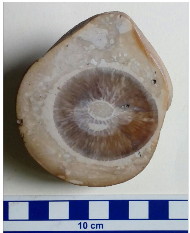
Figure 2. 'Choanite', a polished silicified sponge in flint, (author's collection)