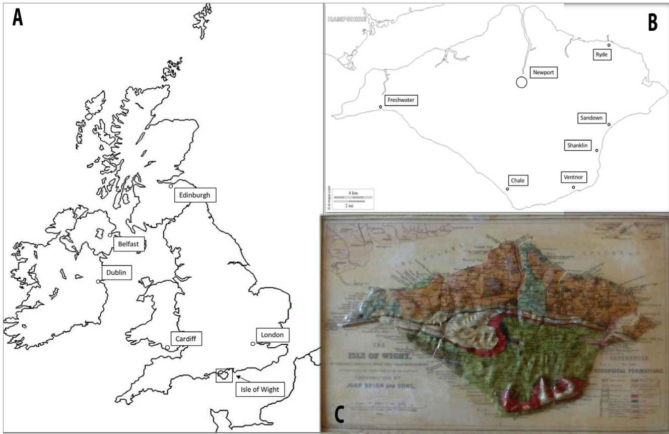
Figure 1. A. Location map, B. Map of the Isle of Wight showing main towns, C. Geological map of the Island in relief published by Brion in 1856.