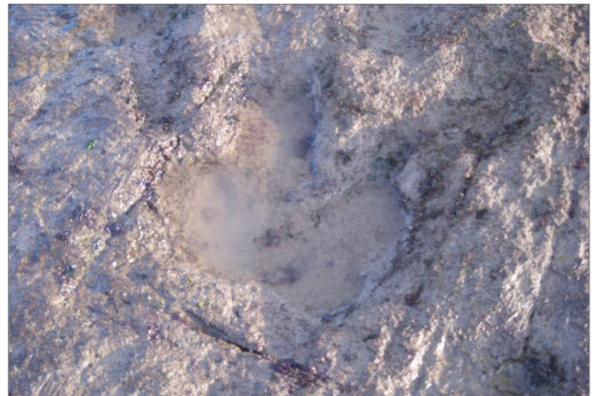
Figure 7. Iguanodon footprint (negative), Brook Bay.

With a new fossil museum and renewed media interest in dinosaurs, one would expect that the Island's tourist economy would be booming once again. It has, conversely, been in steady decline since 1987, and most dramatically since 2007. A rise in the popularity of package holidays, combined with expensive ferry crossings, a global recession, and a change in patterns of consumer spending have undoubtedly had a dramatic effect on Isle of Wight tourism. Visitor numbers have declined from historical highs of around 2.7 million in the 1980's to current levels of around 1.2 million. Recent claims that the Isle of Wight attracts 2.3 m tourists (Munt 2016) are somewhat exaggerated. 2.3m trips to and from the Isle of Wight include repeat journeys by commuters, locals and business people, as well as those made by actual tourists ( in litt. David Shirley, former chairman of the IOW Visitor Attractions Association).