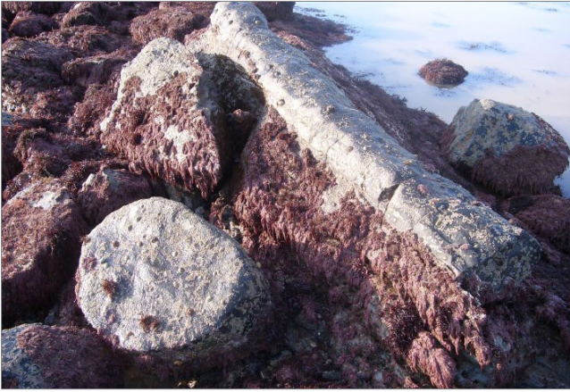
Figure 5. The Fossil Forest at low tide at Hanover Point, Brook Bay.