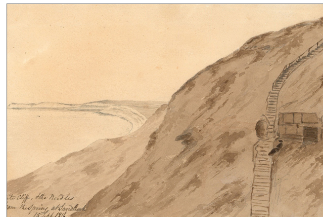
Figure 4. Unpublished drawing of the Sandrock Spring near Blackgang in 1816 (author's collection)