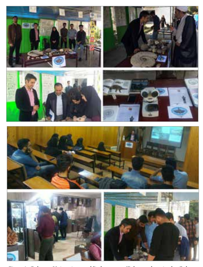
Figure 3. Golestan University, a public lecture on 'Palaeontology in the Golestan Province', and an exhibition presenting posters, fossils and rocks.

- Popov L.E, Hairapetian V, Ghobadi Pour M, Modzalevskaya T.L (2015). A new, unusual rhynchonellide brachiopod with a strophic shell from the Silurian of Iran. Acta Palaeontologica Polonica. 60(3): 747–754.