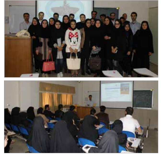
Figure 2. University of Zanjan, a public presentation on the history of the NFD and demonstration of some new discoveries in Iranian Palaeontology.

to the general audience and demonstrating various ways of fossilisation in the lab of the park.