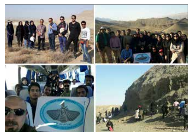
Figure 4. Ferdowsi University of Mashhad, filed excursions to the Kopet-Dagh fossiliferous outcrops.

• Finally, the committee of the Iranian Paleontological Society acknowledged the contributions of the institutions and individuals who organized and supervised the activities during the NFD by sending them award certificates.