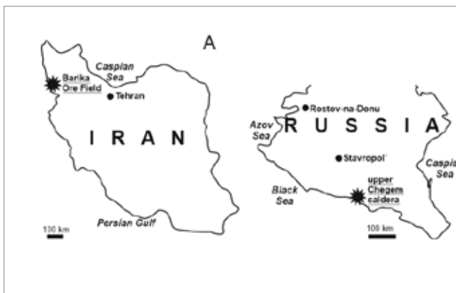
Figure 1. Examples of multi-NMD geosites in northwest Iran (A) and southwest Russia (B).

This study is based on the conceptual analysis of the idea of NMD localities as potential geosites. First, it is demonstrated that these localities should be recognized as geosites and that they require geoconservation activities. Second, the value of NMD geosites is a subject of special analysis. Third, factors limiting the value of NMD geosites have to be taken into account. The IMA list of valid minerals (see http://www.ima-mineralogy.org/Minlist.htm ) is used as an essential source of factual information; moreover, some representative examples from Iran and Russia (Fig. 1) are employed for illustration of some issues linked to NMD geosites.