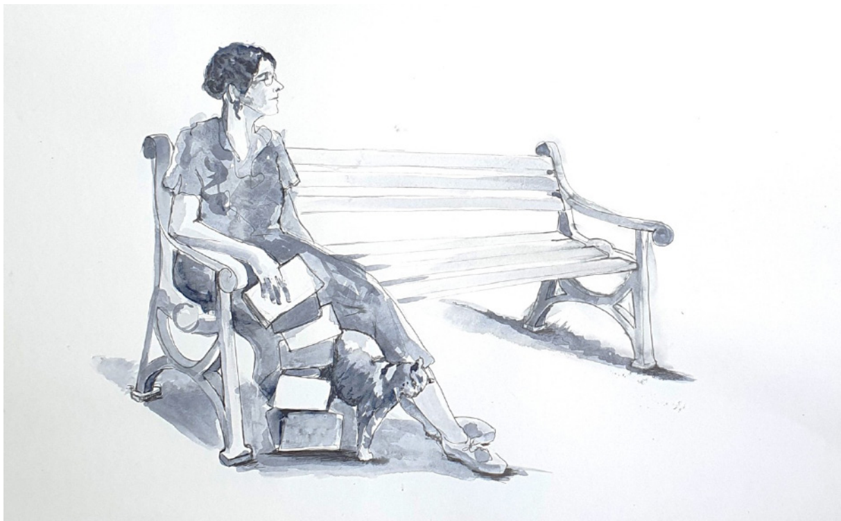
Figure 8. Initial sketches of Sylvia Townsend Warner by sculptor Denise Dutton