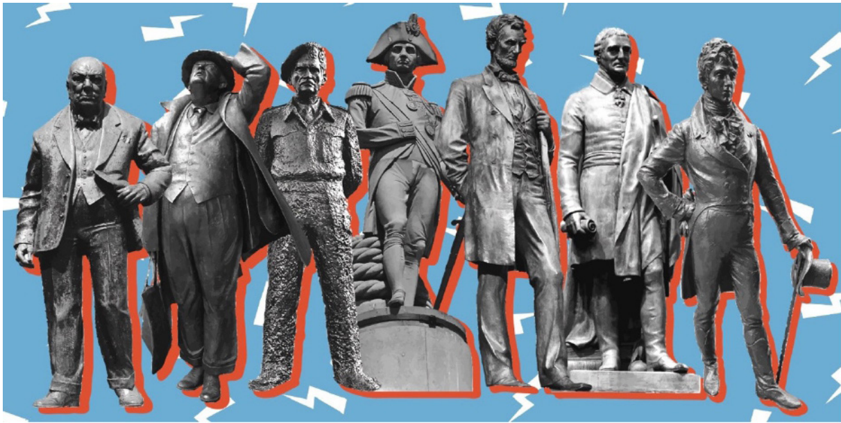
Figure 5. Who are we putting on pedestals? 85% of statues in the UK commemorate the deeds of men.

artist and the named individual was assigned a gender, with all others classified as ‘unknown’. It turns out that there are more statues of men called John (82) than all named non-royal women – among these, John Lennon has eight statues.