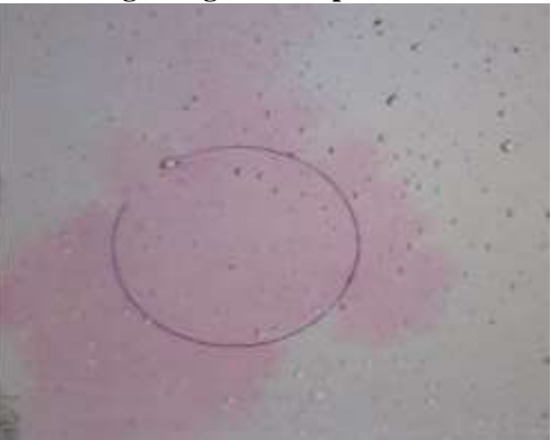
Figure 5 - Experiment on the concrete surface color of the sample with 2.5% titanium dioxide after 24 hours. Comparison of Figure 4 and 5 shows that self - cleaning properties were significantly affected by Nano TiO2.