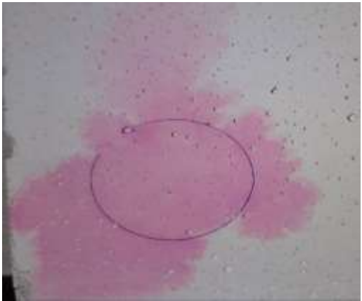
Figure 4 - Experiment on the concrete surface color of the sample with 2.5% titanium dioxide at the beginning of the experiment.