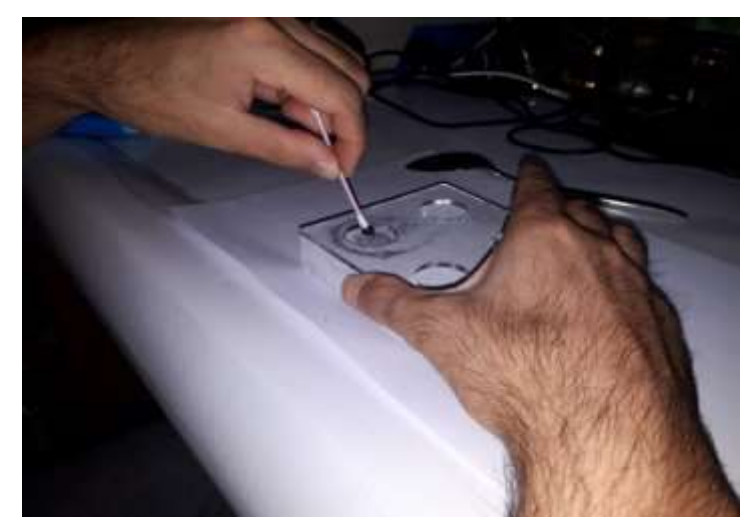
Figure 3 -Surface of concrete sample impregnated. Rhodamine B (pink) was spread on the concrete surface.