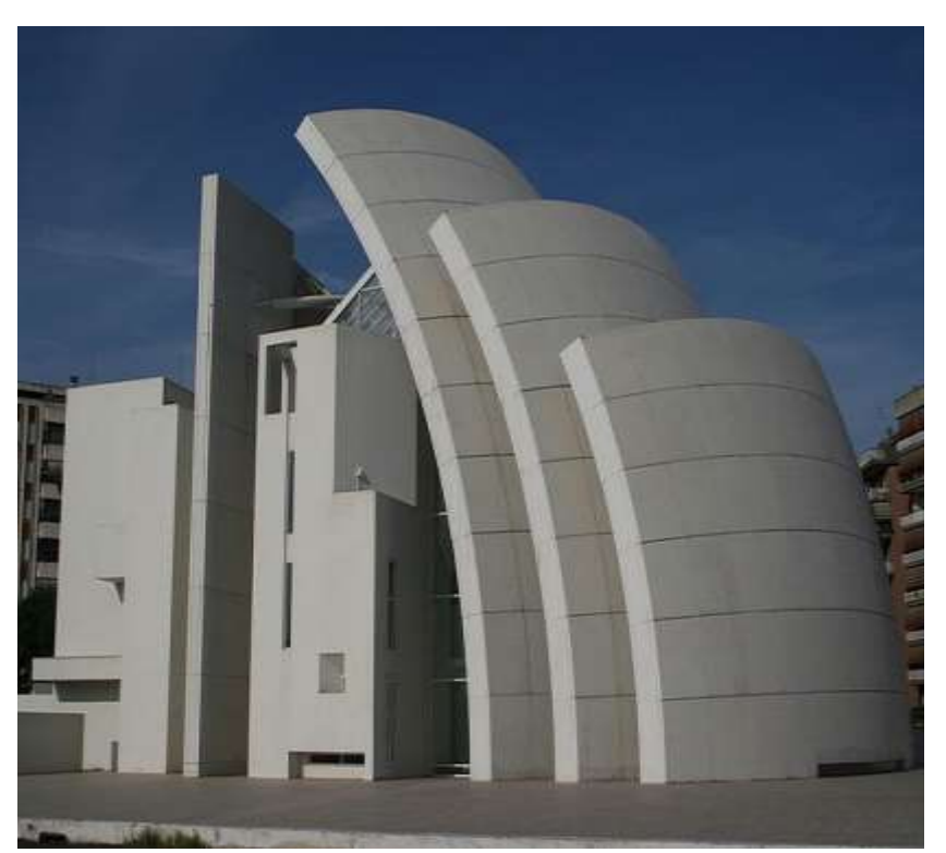
Figure 1- Jubilee Church, Rome, Italy. In the facade of this structure, concrete is used to combine titanium dioxide nanoparticles

The essential feature of the network is the existence of horizontal spider web links between its components that distinguish it from other bureaucratic structures (Gilchrist 2009). Networks facilitate social interactions and reduce transaction costs (Isett et al. 2011; Fischer, 1990).