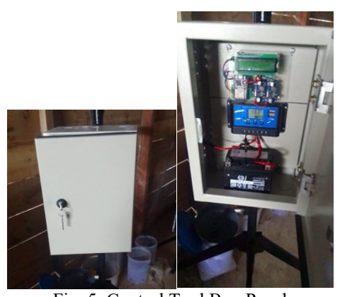
Fig. 5. Control Tool Box Panel

The controller box is used as a container for a series of electronic components. The panel box used measures 35cm x 25cm. The panel box can be seen in Fig. 5.