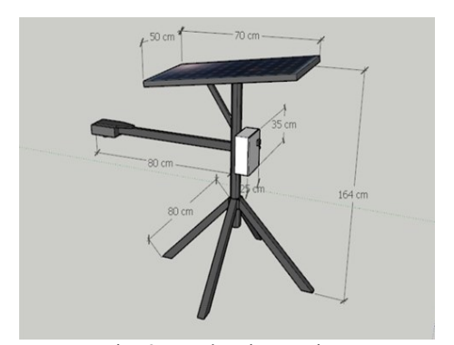
Fig. 2. Tool Suite Design.

Program design includes the stages of making programs using C ++ language through the Arduino ide application, designing electronic circuits and program loading processes.