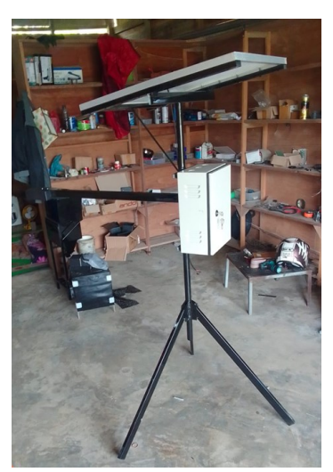
Fig. 4. Real Design of flood detection tool using HC-SR04 sensor based on Virtuino.

Flood detection tools using virtuino-based HC-SR04 sensors are made specifically to detect water levels. This tool is a simple tool that utilizes the esp32 microcontroller and real-time monitoring media via a smartphone. This virtuino-based flood detection tool using HC-SR04 sensors consists of a tool frame that is generally made of iron, HC-SR04 sensors, solar panels and box controllers. The main power source on the appliance comes from solar panels with a capacity of 50wp and is stored on a 12V 5ah battery. The results of the design of flood detection equipment using a virtuino-based HC-SR04 sensor can be seen in Fig. 4