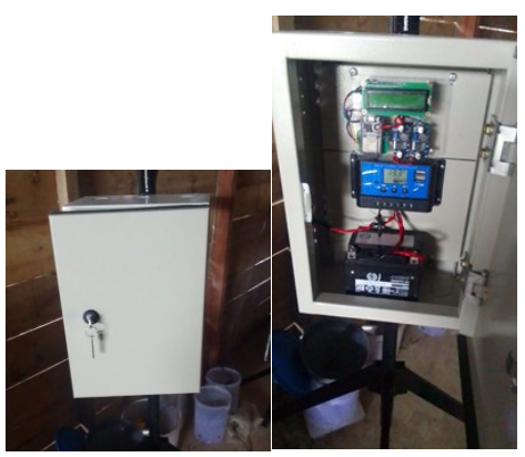
Fig. 5. Control Tool Box Panel

The controller box is used as a container for a series of electronic components. The panel box used measures 35cm x 25cm. The panel box can be seen in Fig. 5.