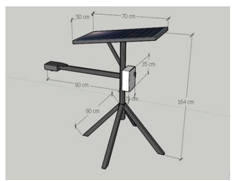
Fig. 2. Tool Suite Design.

Program design includes the stages of making programs using C ++ language through the Arduino ide application, designing electronic circuits and program loading processes.