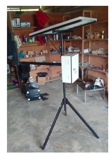
Fig. 4. Real Design of flood detection tool using HC-SR04 sensor based on Virtuino.

Flood detection tools using virtuino-based HC-SR04 sensors are made specifically to detect water levels. This tool is a simple tool that utilizes the esp32 microcontroller and real-time monitoring media via a smartphone. This virtuino-based flood detection tool using HC-SR04 sensors consists of a tool frame that is generally made of iron, HC-SR04 sensors, solar panels and box controllers. The main power source on the appliance comes from solar panels with a capacity of 50wp and is stored on a 12V 5ah battery. The results of the design of flood detection equipment using a virtuino-based HC-SR04 sensor can be seen in Fig. 4