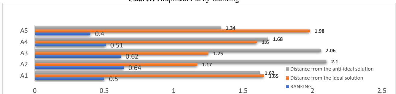
Chart1. Graphical Fuzzy Ranking